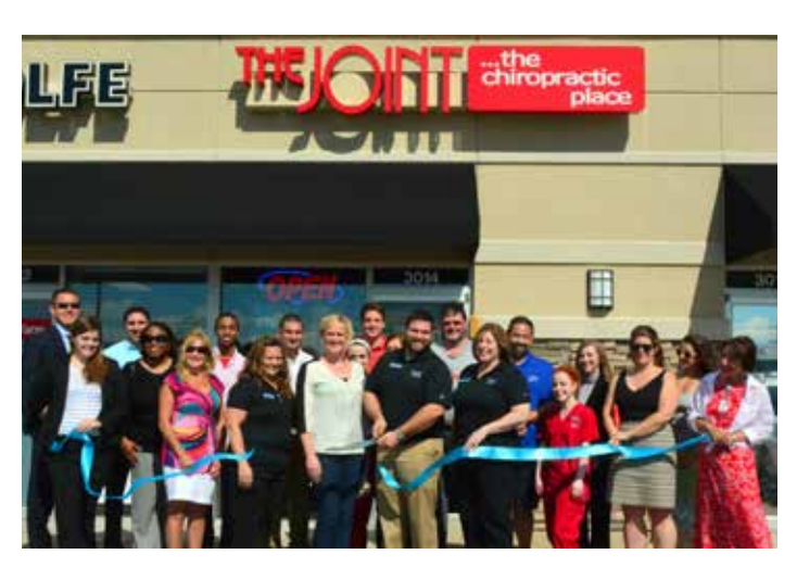
The Joint... the chiropractic place, August 12