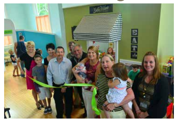
Edwardsville Children's Museum Bella Milano Restaurant Exhibit, August 8