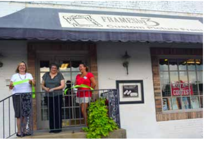
Frames By 3, August 27