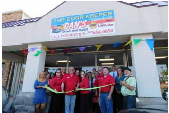
Dan's Garage Door Service, September 22