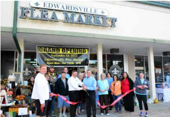
Edwardsville Flea Market, September 12