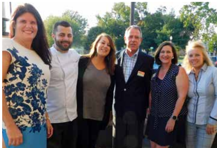
1818 Chophouse, BARBERMurphy Group, Illinois Title & Escrow, September 17