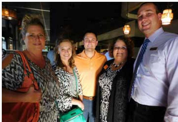
1818 Chophouse, BARBERMurphy Group, Illinois Title & Escrow, September 17