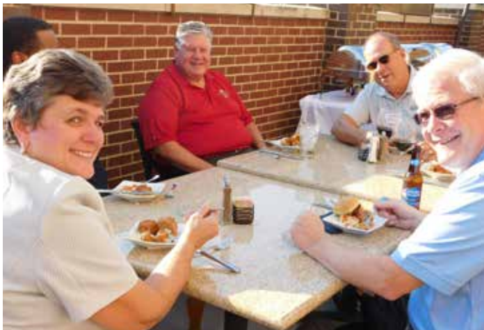
1818 Chophouse, BARBERMurphy Group, Illinois Title & Escrow, September 17