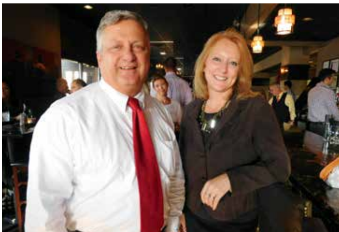
1818 Chophouse, BARBERMurphy Group, Illinois Title & Escrow, September 17