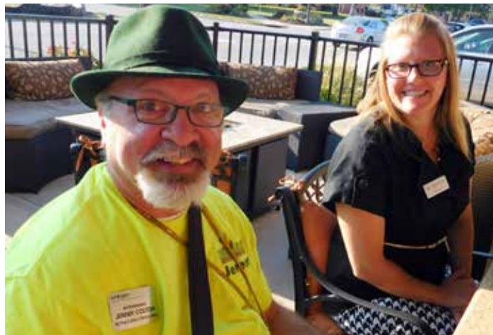
1818 Chophouse, BARBERMurphy Group, Illinois Title & Escrow, September 17