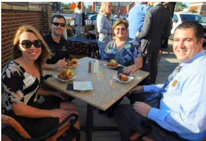
1818 Chophouse, BARBERMurphy Group, Illinois Title & Escrow, September 17