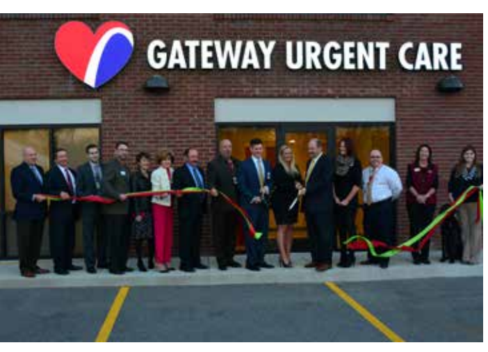
Gateway Regional Medical Center Urgent Care, October 29