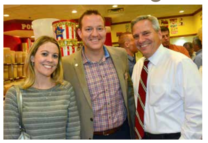
Chef's Shoppe, October 16