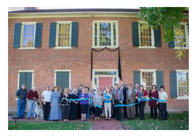
Colonel Benjamin Stephenson House New Roof, October 7