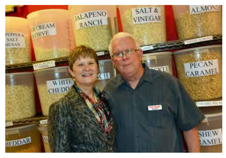
Chef's Shoppe, October 16