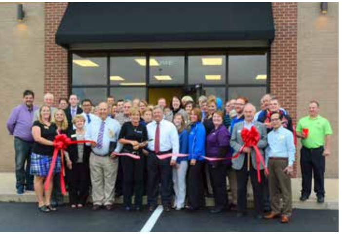
Express Employment Professionals, October 9