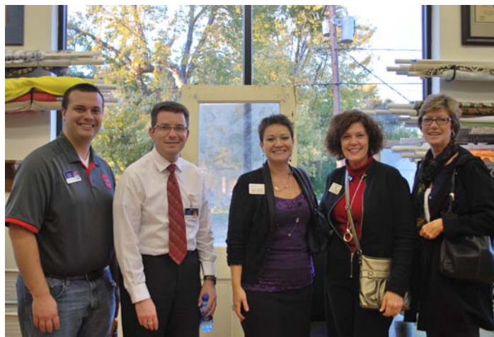
Visions by Carol Photography, October 24