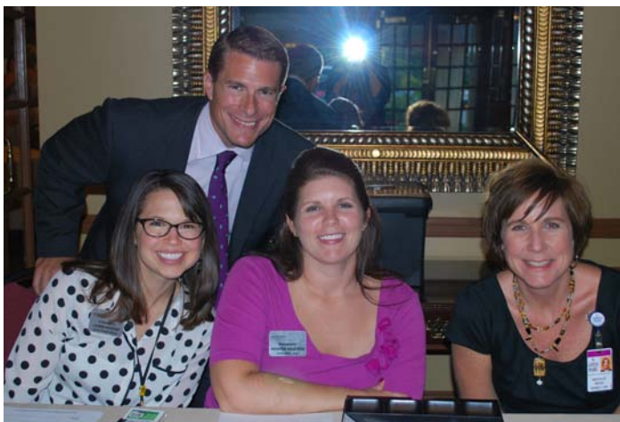
Battery Specialists + Golf Cars & Sunset Hills Country Club, October 10