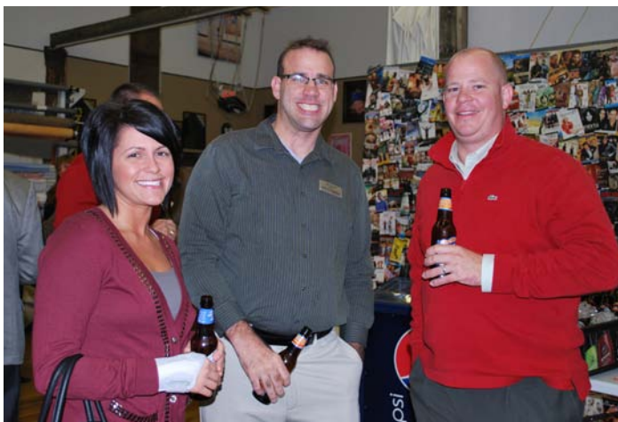
October 24