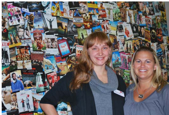
Visions by Carol Photography, October 24