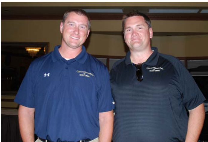
Battery Specialists + Golf Cars & Sunset Hills Country Club, October 10