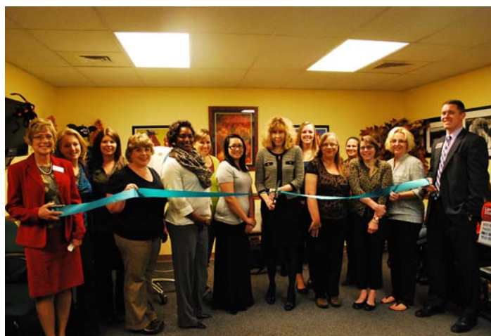
Schaberg Dermatology, October 17