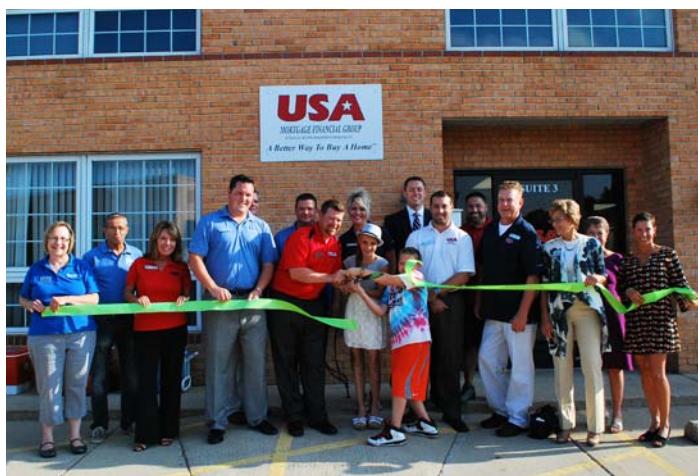
USA Mortgage Financial Group, October 1