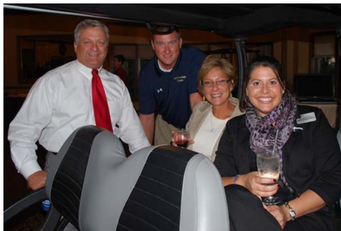
Battery Specialists + Golf Cars & Sunset Hills Country Club, October 10