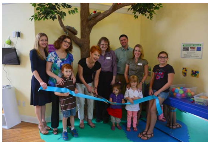
The Children's Museum Boeing Science Exhibit, October 5