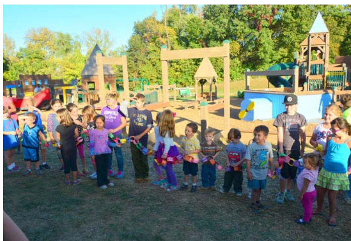
Edwardsville Rotary Playground at Township Park, October 13