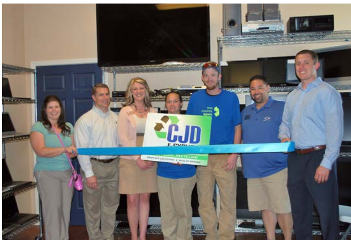
CJD E-Cycling Boutique, April 25