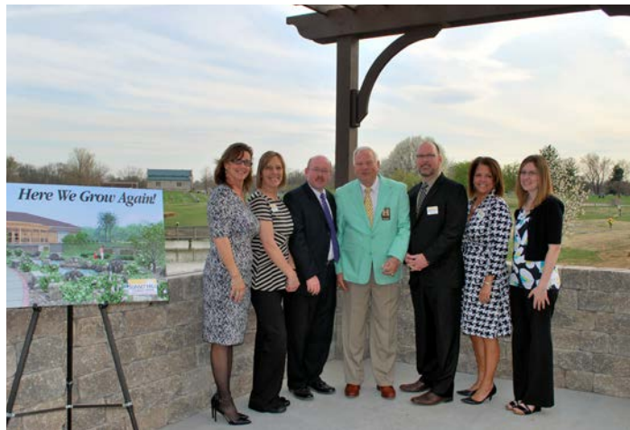
Sunset Hill Funeral Home & Cemetery, April 17