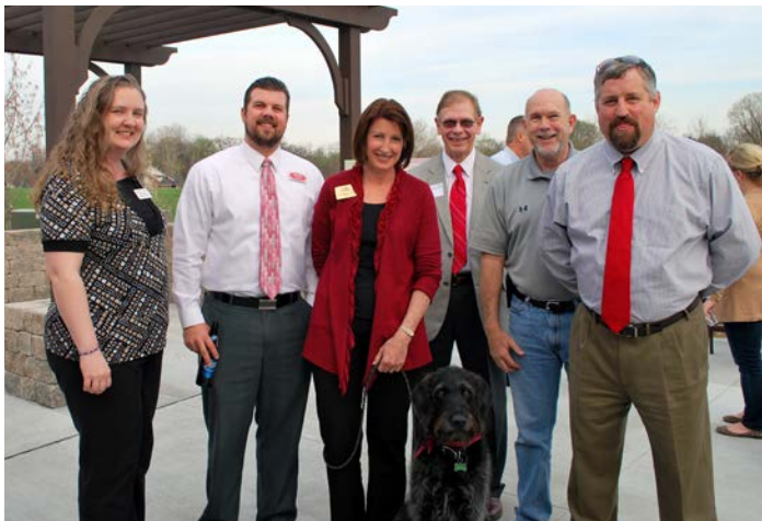
Sunset Hill Funeral Home & Cemetery, April 17