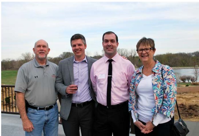
Sunset Hill Funeral Home & Cemetery, April 17