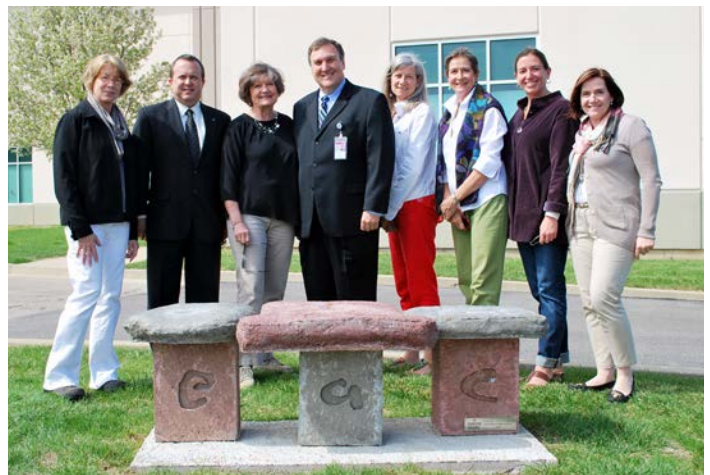
Anderson Hospital Bench Monument at Edwardsville Arts Center, April 23