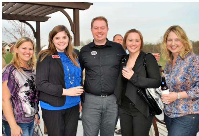
Sunset Hill Funeral Home & Cemetery, April 17