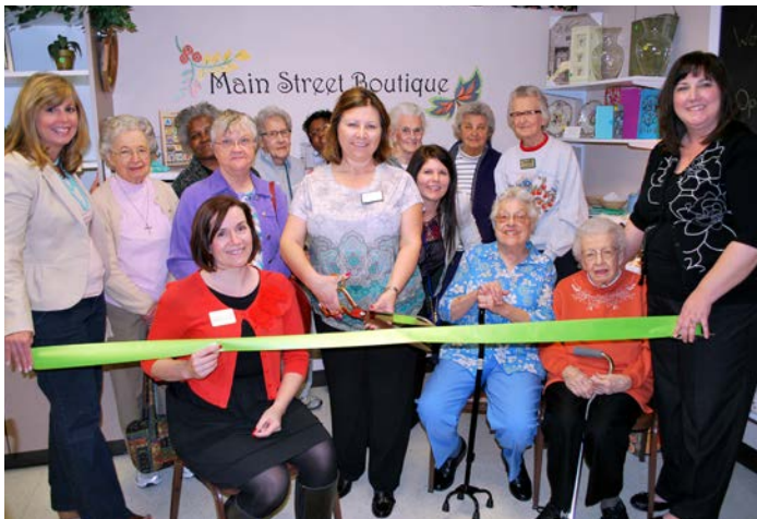
Main Street Community Center Boutique, April 1