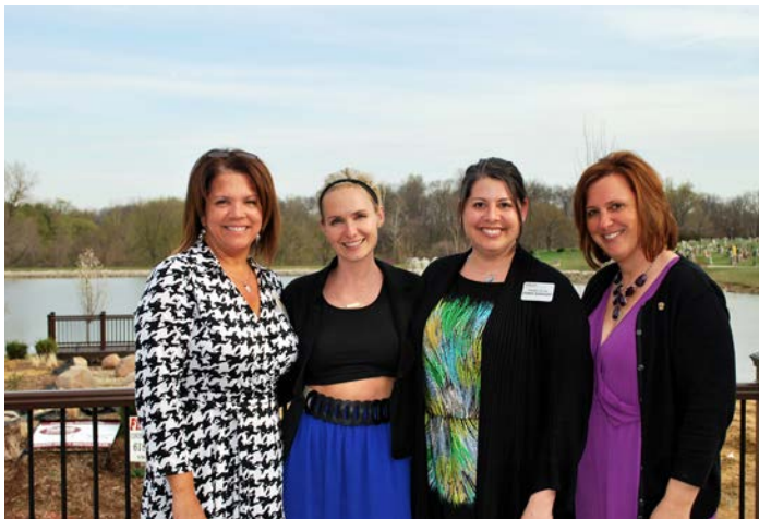
Sunset Hill Funeral Home & Cemetery, April 17