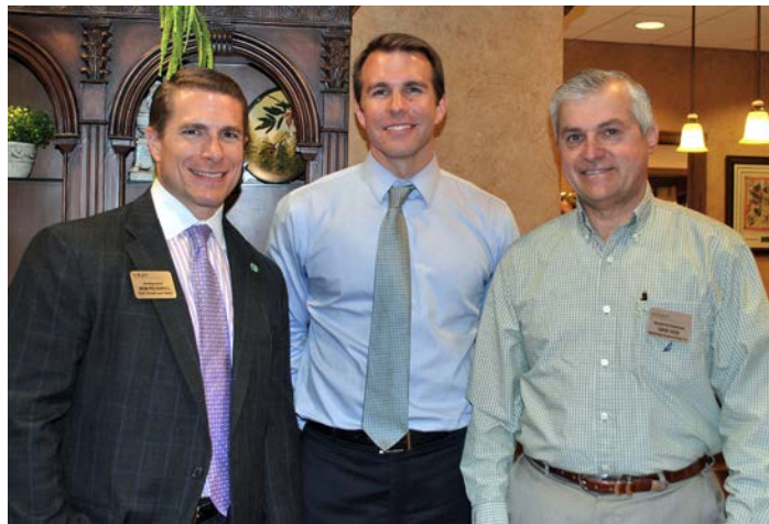
Sunset Hill Funeral Home & Cemetery, April 17