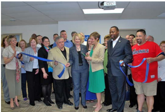
United Way of Greater St. Louis - SW IL Division, April 10