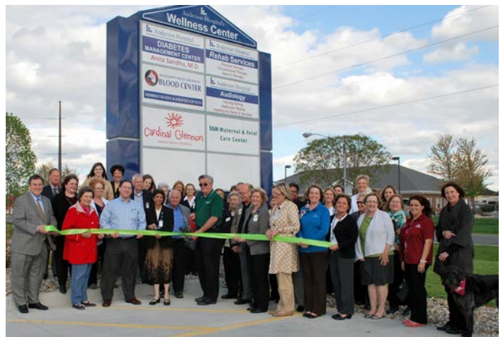
Anderson Hospital Wellness Center, April 30