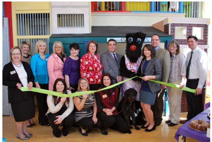
Scott Credit Union Exhibit at The Children's Museum, April 1