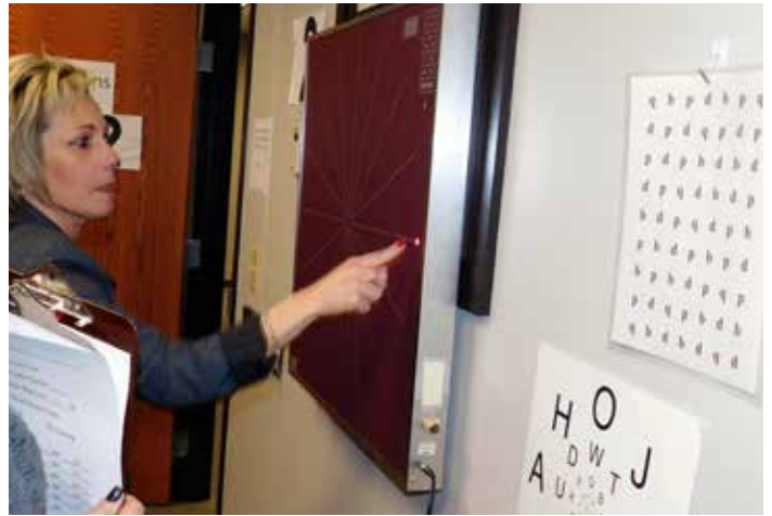
Vision For Life, February 16