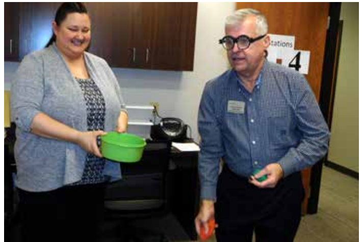
Vision For Life, February 16