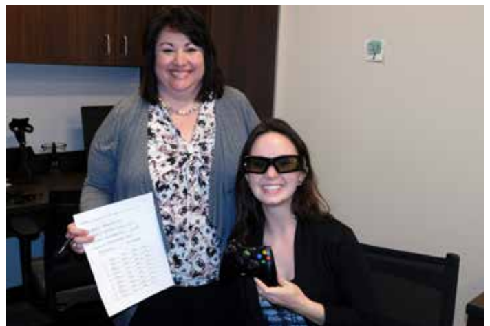
Vision For Life, February 16