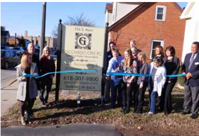
Gucciardo CPAs, PC, February 15