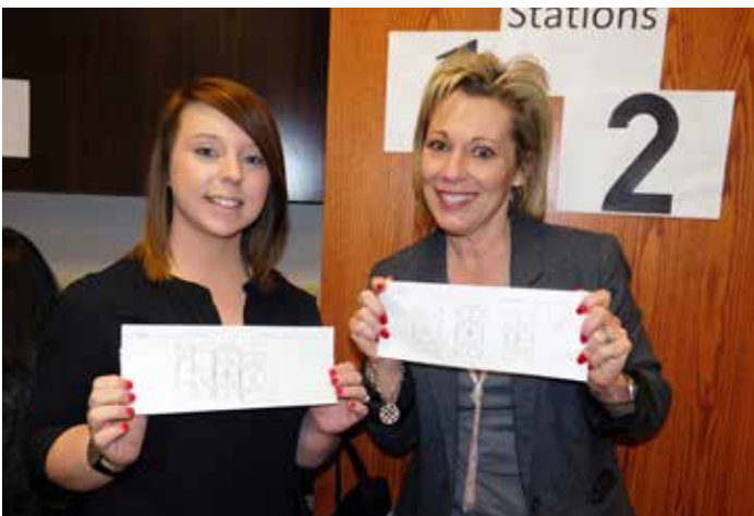
Vision For Life, February 16