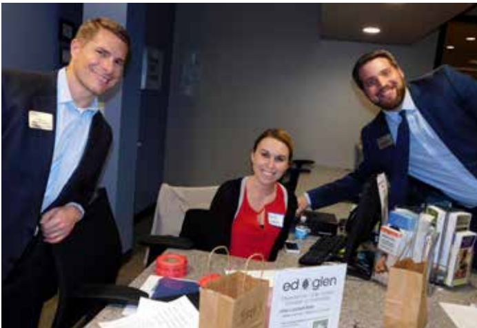
Vision For Life, February 16