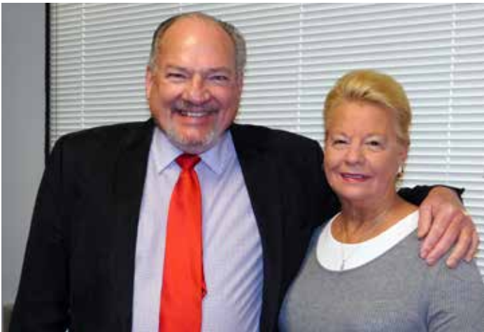
Vision For Life, February 16