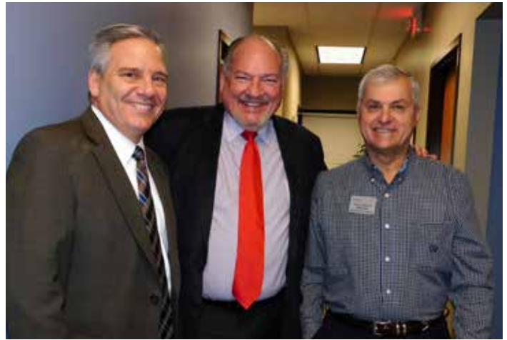
Vision For Life, February 16