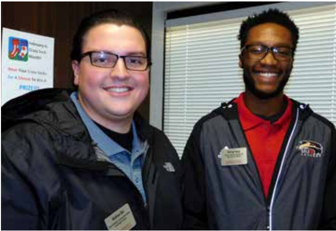
Vision For Life, February 16