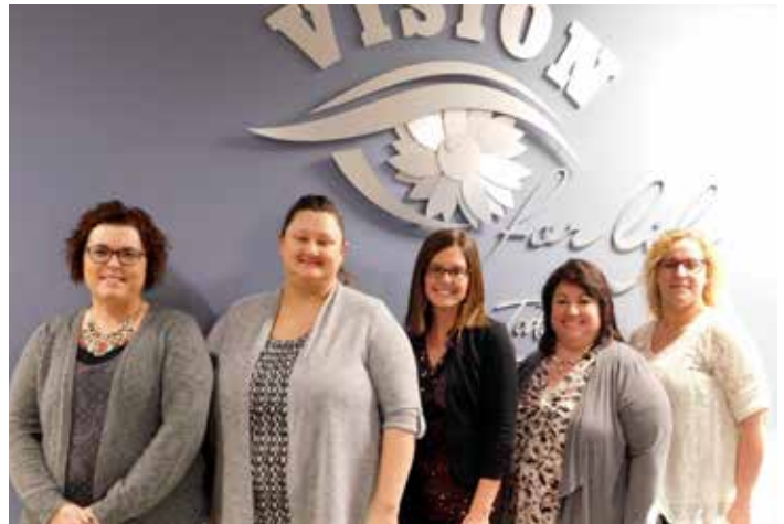
Vision For Life, February 16