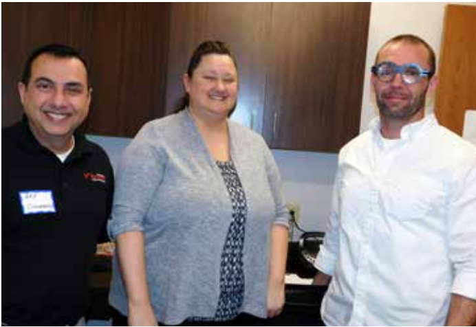
Vision For Life, February 16