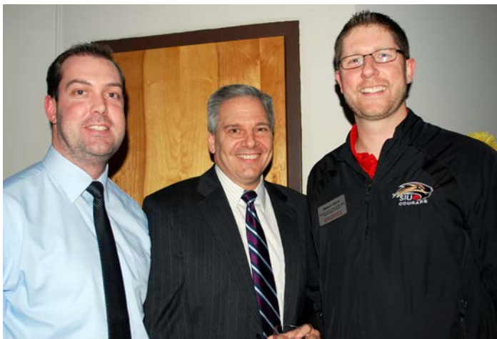
Robust Wine Bar & Floria, February 20