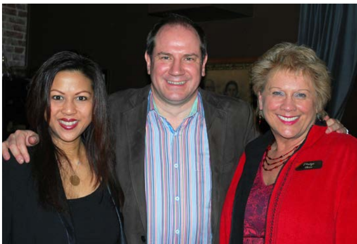
Robust Wine Bar & Floria, February 20