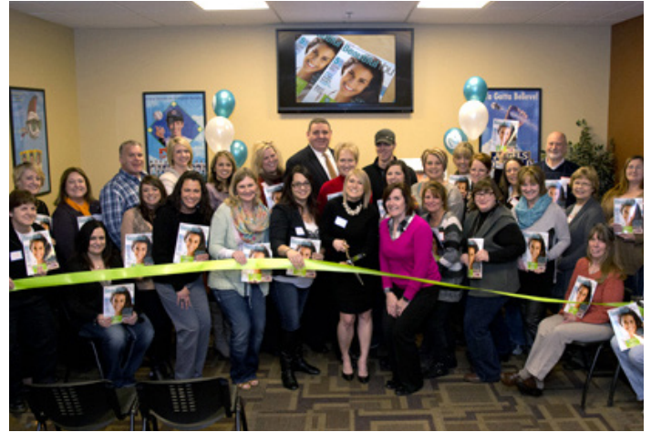
Nerium International, February 27