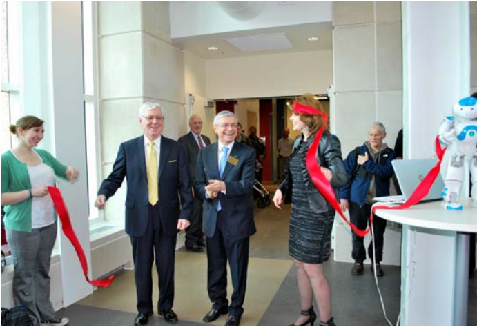
SIUE School of Engineering Expansion, February 18