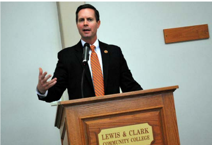
U.S. Congressman Rodney Davis at Legislative Summit, February 24