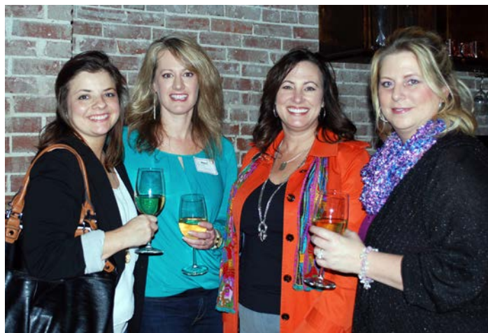
Robust Wine Bar & Floria, February 20