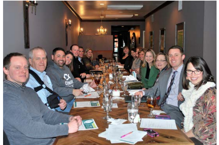
Ambassador Meeting, February 4