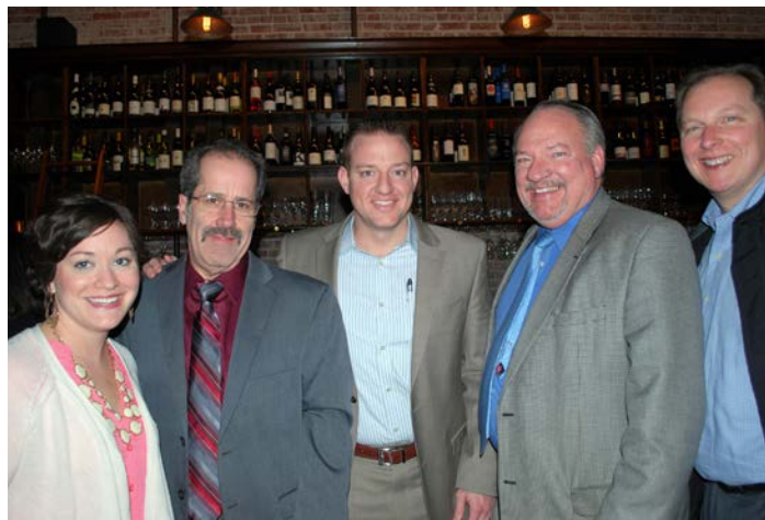
Robust Wine Bar & Floria, February 20