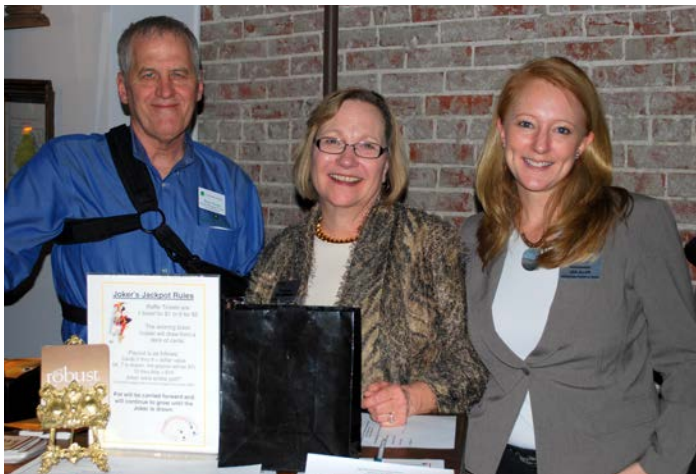
Robust Wine Bar & Floria, February 20