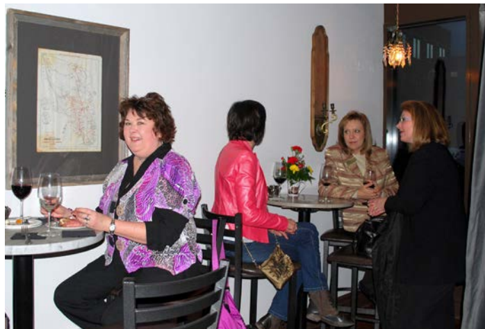
Robust Wine Bar & Floria, February 20