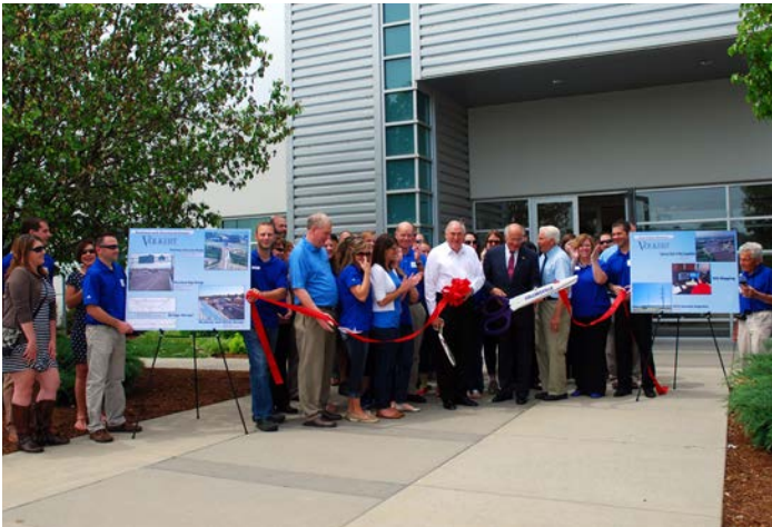
Volkert, Inc., May 9