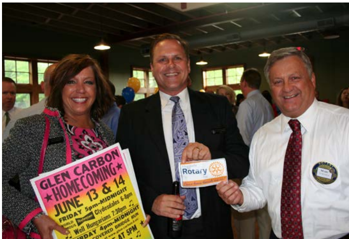
Edwardsville Rotary Club, May 15