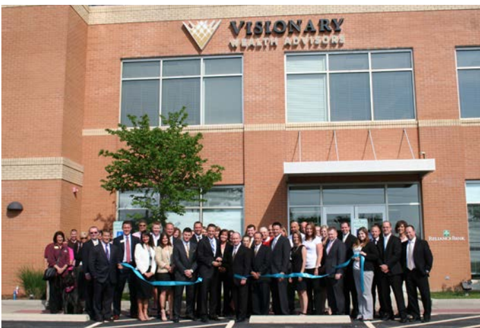
Visionary Wealth Advisors, May 22