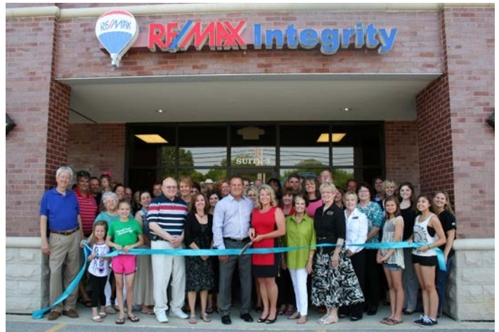
RE/MAX Integrity Real Estate Centre, May 20