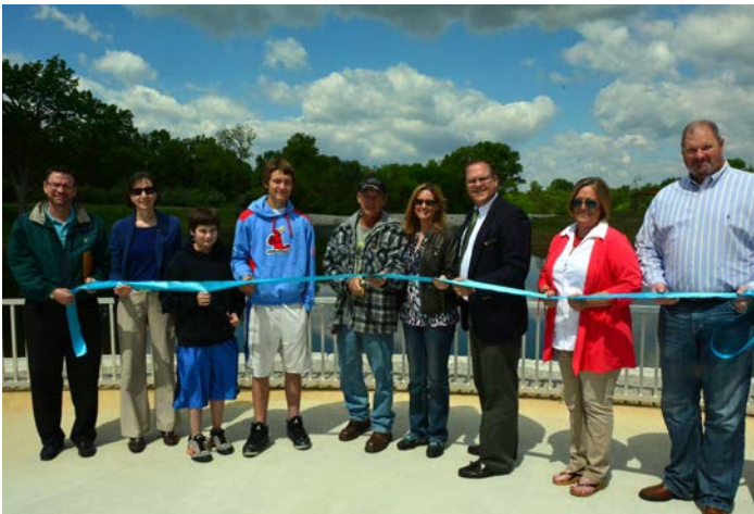
Glen Carbon Schon Park Phase I, May 17