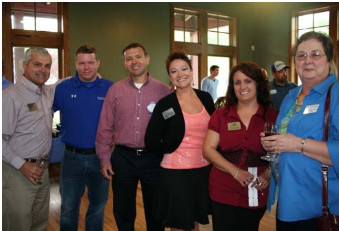
Edwardsville Rotary Club, May 15