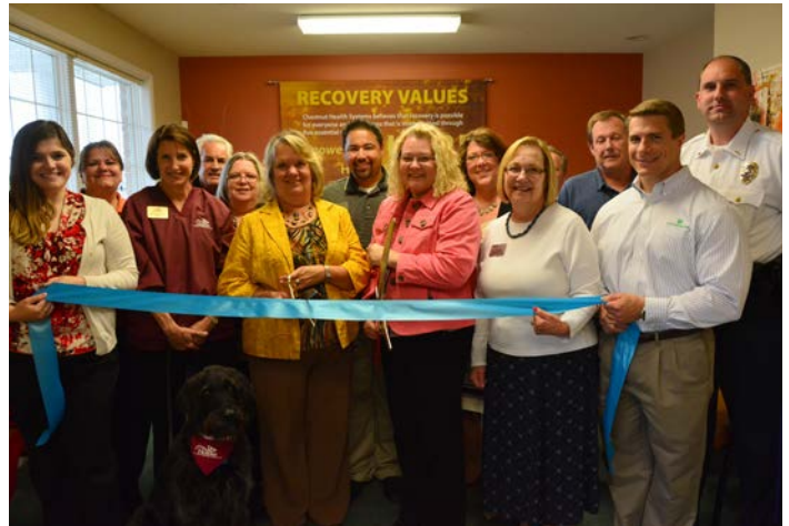
Chestnut Health Systems, May 16