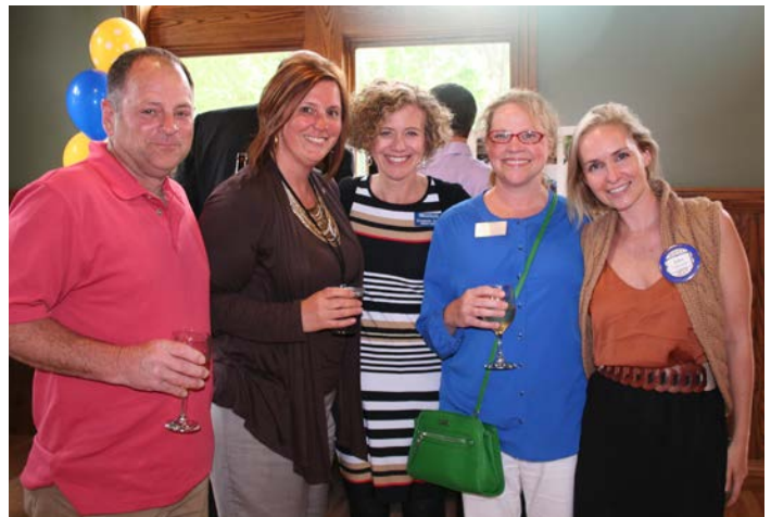
Edwardsville Rotary Club, May 15