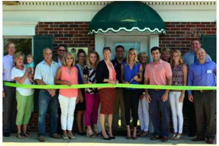
Ribbon Cutting @ The Chiropractic Wellness Center Glen Carbon, June 21