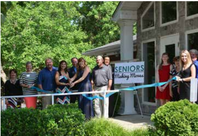
Ribbon Cutting @ Seniors Making Moves, June 22