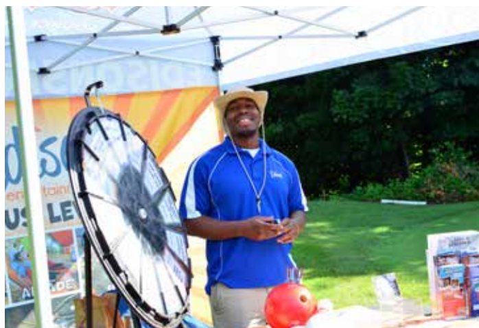
Hosted @ Sunset Hills Country Club, June 24