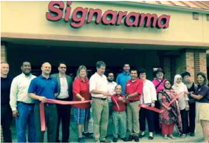
Ribbon Cutting @ Signarama, June 3