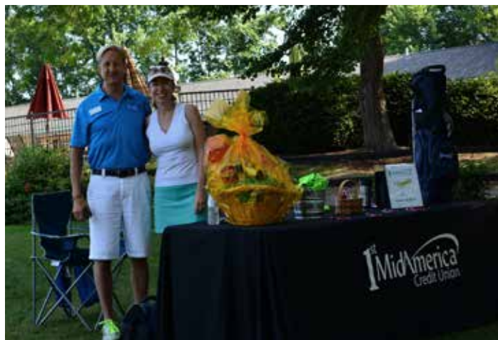
Hosted @ Sunset Hills Country Club, June 24