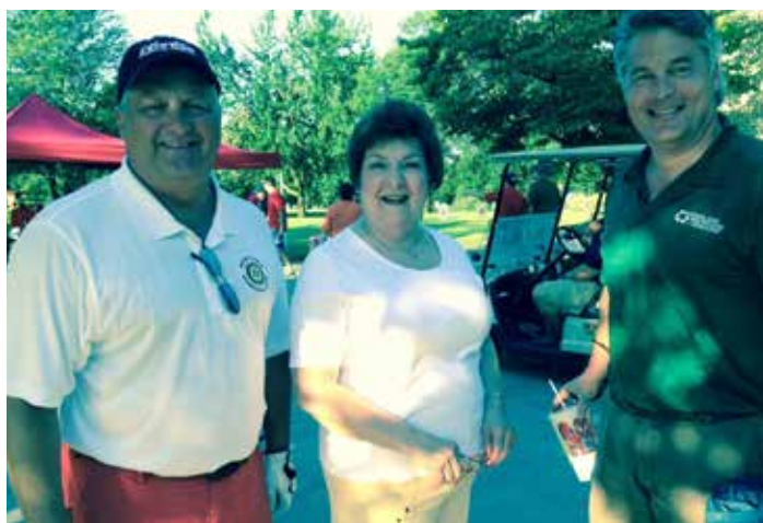
Hosted @ Sunset Hills Country Club, June 24