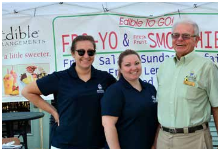
Hosted @ Sunset Hills Country Club, June 24