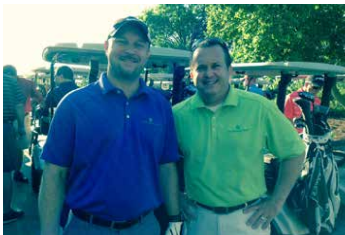
Hosted @ Sunset Hills Country Club, June 24