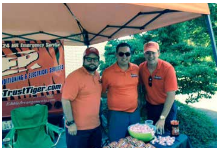
Hosted @ Sunset Hills Country Club, June 24