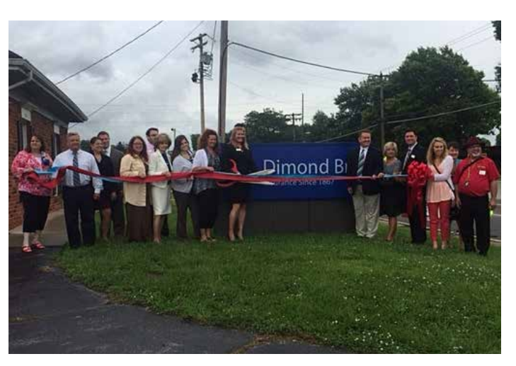
Dimond Bros. Insurance, LLC, June 17