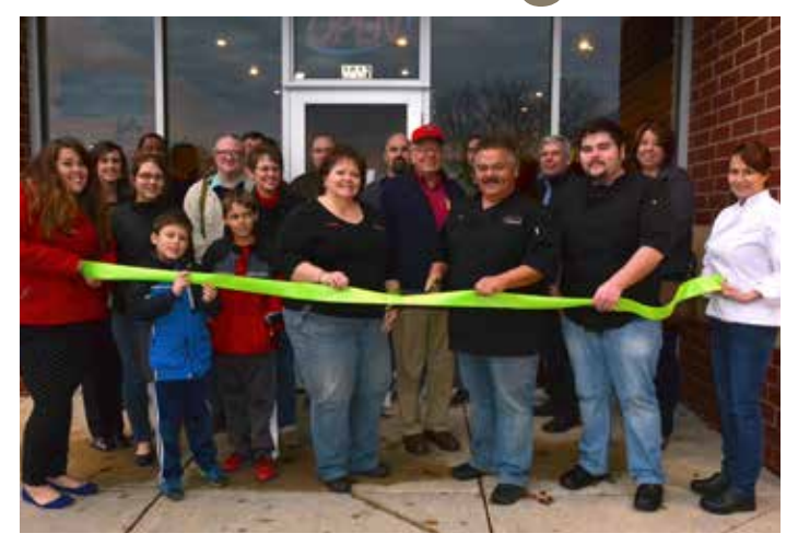
Doc's Smokehouse & Catering, December 1