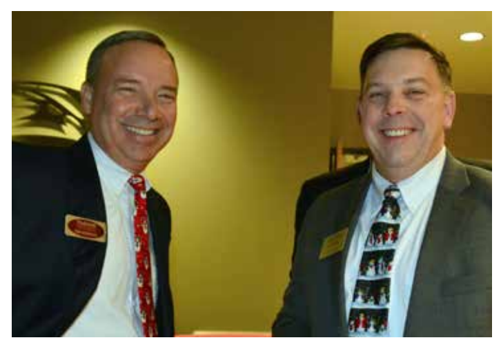
SIUE School of Business & SIUE Athletics, December 18