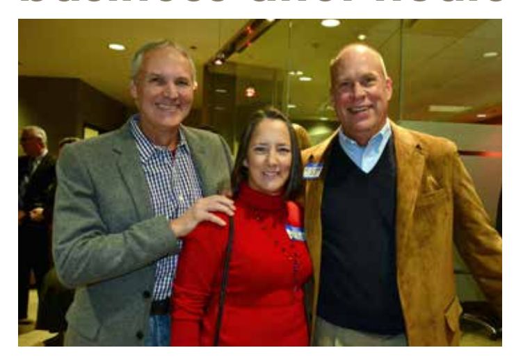
SIUE School of Business & SIUE Athletics, December 18