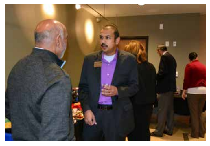
SIUE School of Business & SIUE Athletics, December 18