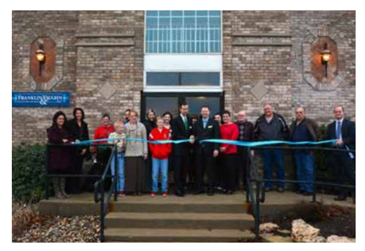
Franklin & Vaughn, LLC, December 15