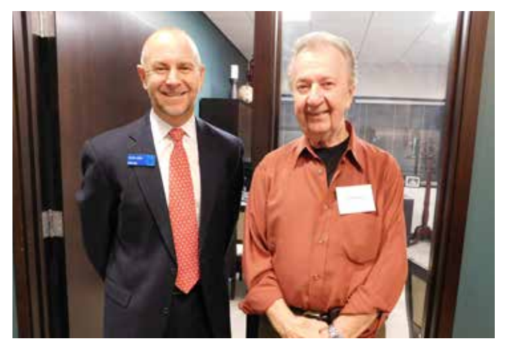
Merrill Lynch, November 17