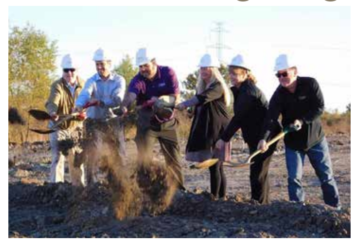
Donco Electrical Construction & Fowler Management Services, November 9