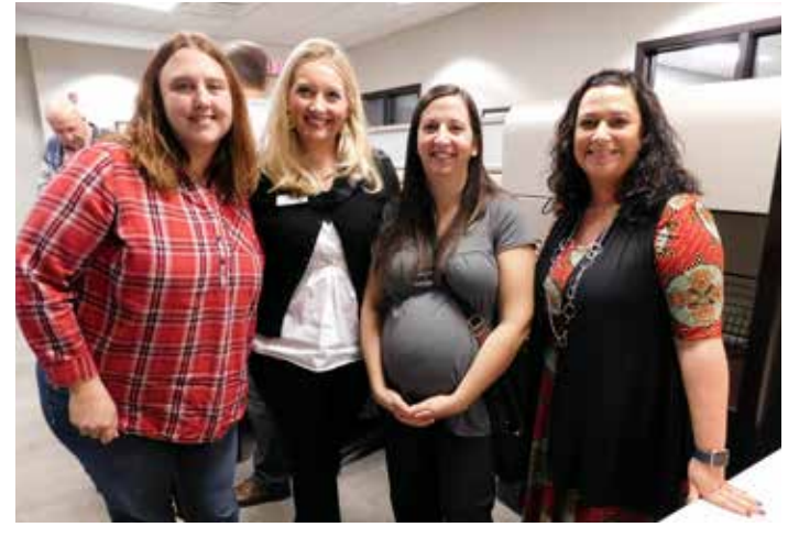
Merrill Lynch, November 17