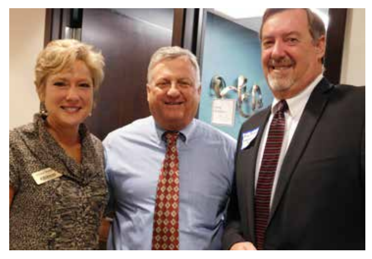
Merrill Lynch, November 17