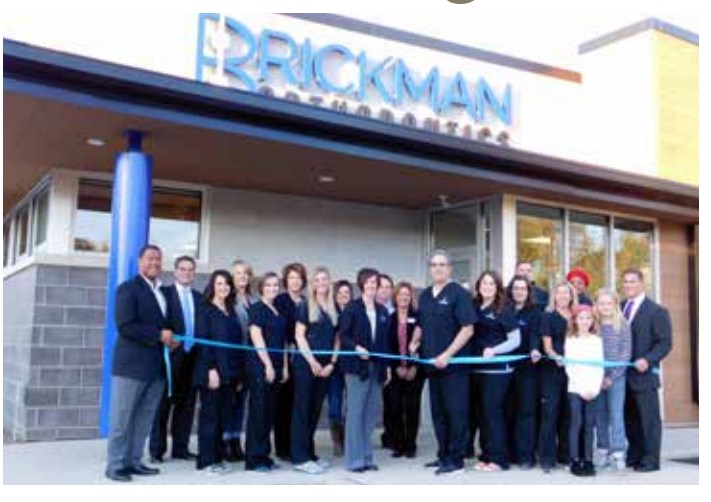
Brickman Orthodontics, November 10