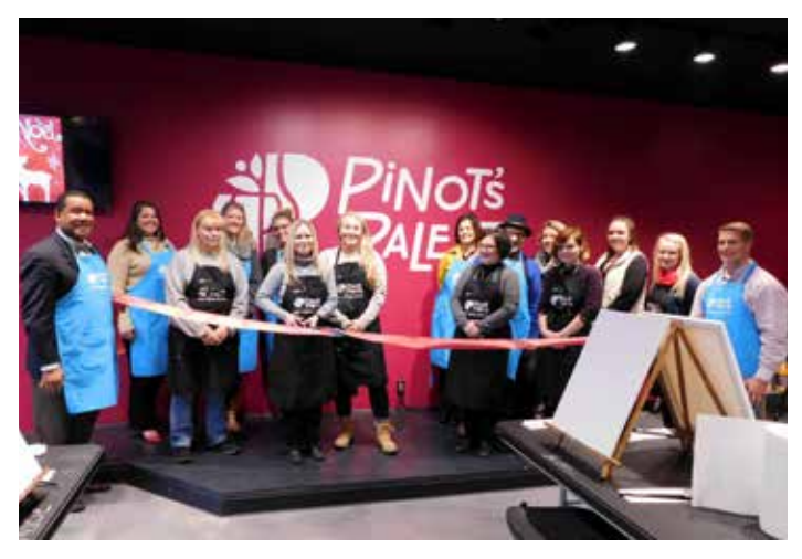
Pinot's Palette, November 22

Chamber of Common Ground December 2016 | 9