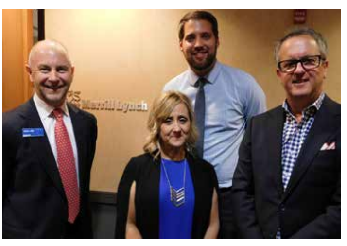
Merrill Lynch, November 17