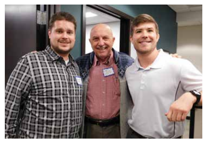
Merrill Lynch, November 17