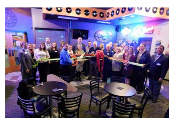
Edison's Entertainment Complex Party Room, November 16