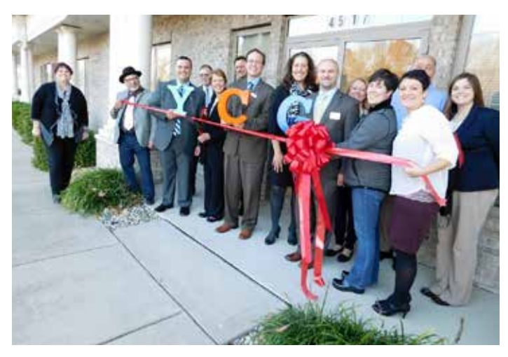
YCG Accounting, November 5