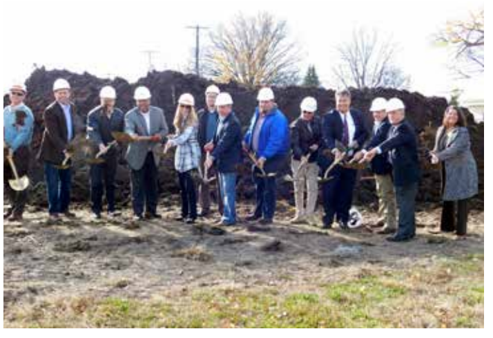
Plocher Construction Park Street Plaza Project, November 20