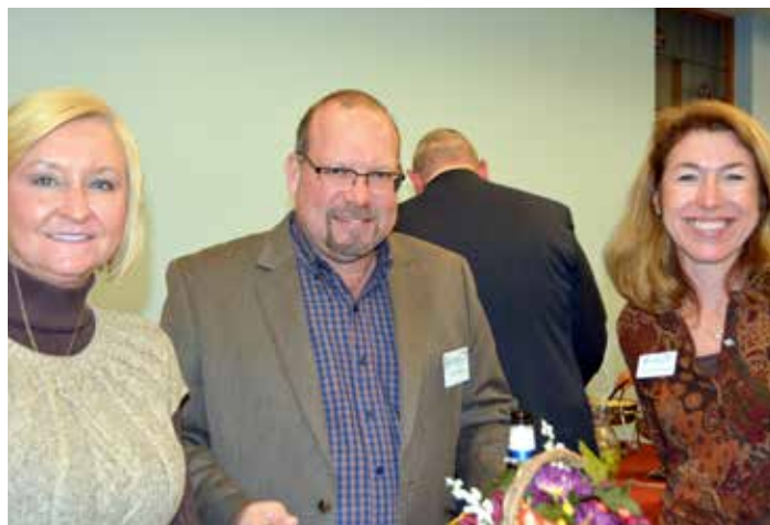
1st MidAmerica Credit Union & Hospice of Southern Illinois, November 20