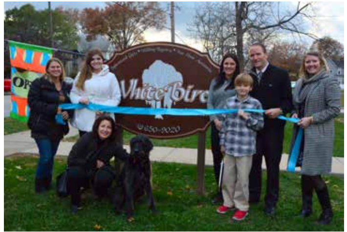
White Birch Interiors & Home Accents, November 13