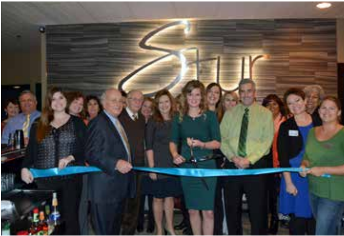
Stur Restaurant, November 12