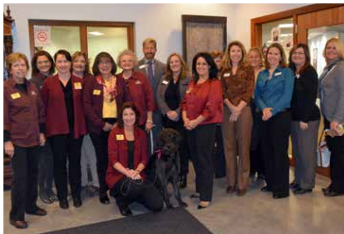
1st MidAmerica Credit Union & Hospice of Southern Illinois, November 20