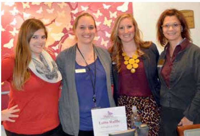
1st MidAmerica Credit Union & Hospice of Southern Illinois, November 20