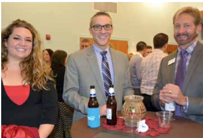
1st MidAmerica Credit Union & Hospice of Southern Illinois, November 20