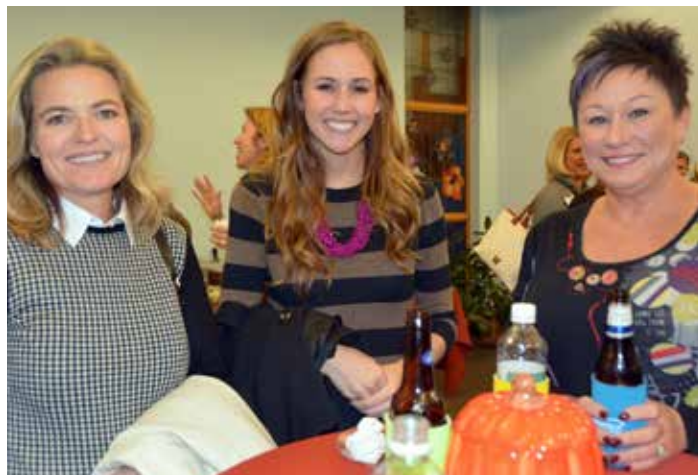
1st MidAmerica Credit Union & Hospice of Southern Illinois, November 20