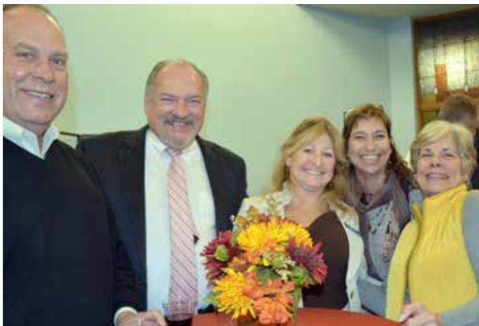
1st MidAmerica Credit Union & Hospice of Southern Illinois, November 20