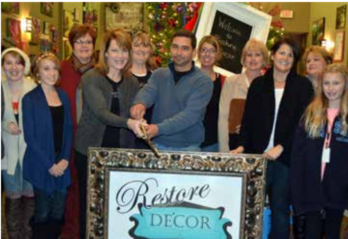
Restore Decor, November 17