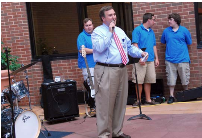
Anderson Hospital, August 4