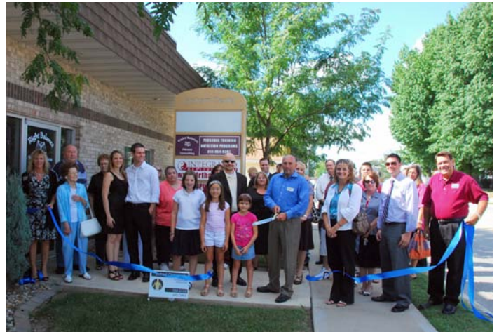
Integrated Medical Group, August 11