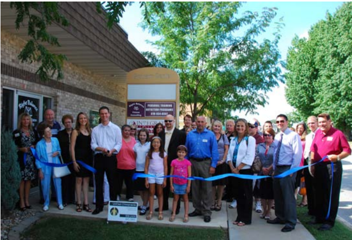
Unfried Chiropractic, August 11