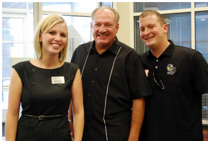
Regions Bank, August 18