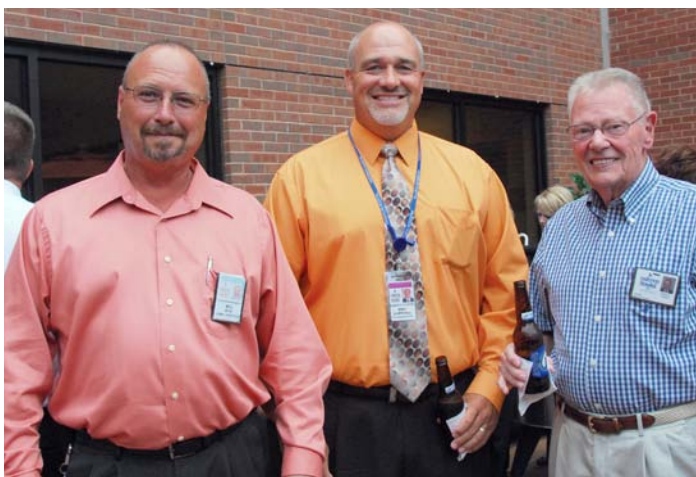
Anderson Hospital, August 4