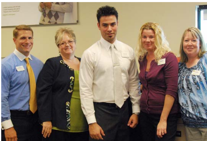
Regions Bank, August 18