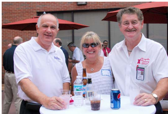
Anderson Hospital, August 4