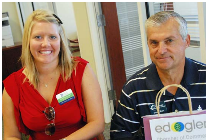
Regions Bank, August 18