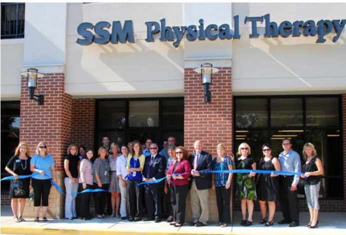
SSM Physical Therapy, August 24