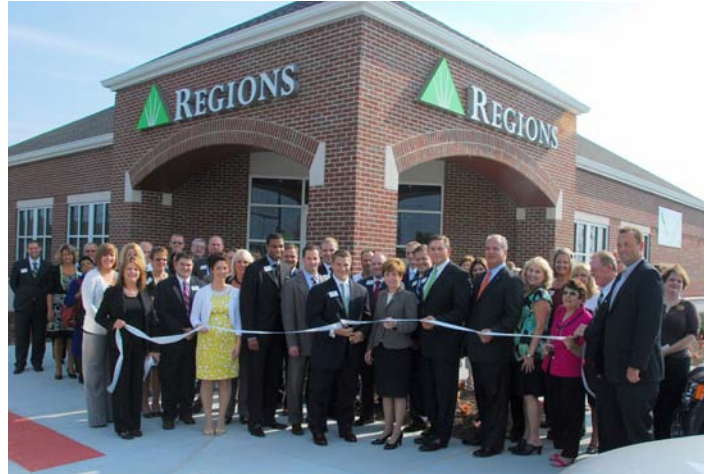
Regions Bank, August 19