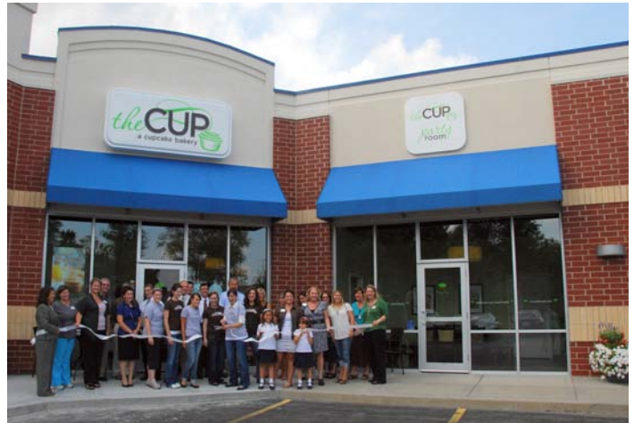
The Cup, August 31