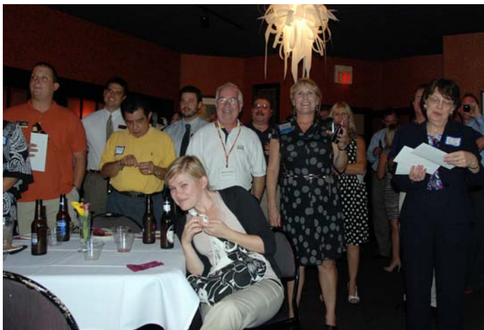
Neruda & BPW, September 2