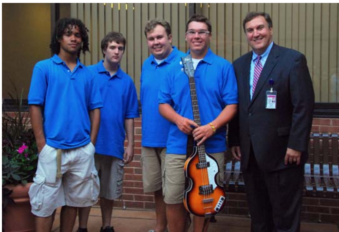
Anderson Hospital, August 5