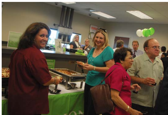
Regions Bank, August 19