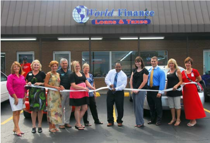
World Finance Corp., August 12