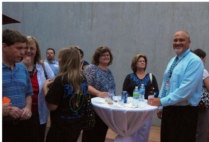
Anderson Hospital, August 5