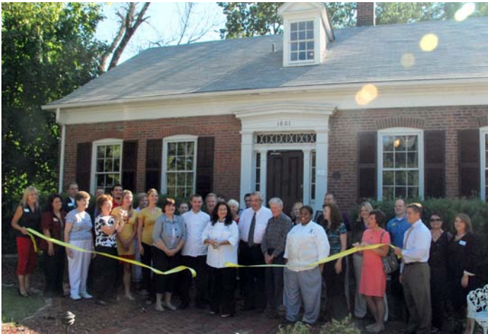
Grace Manor Restaurant, August 25