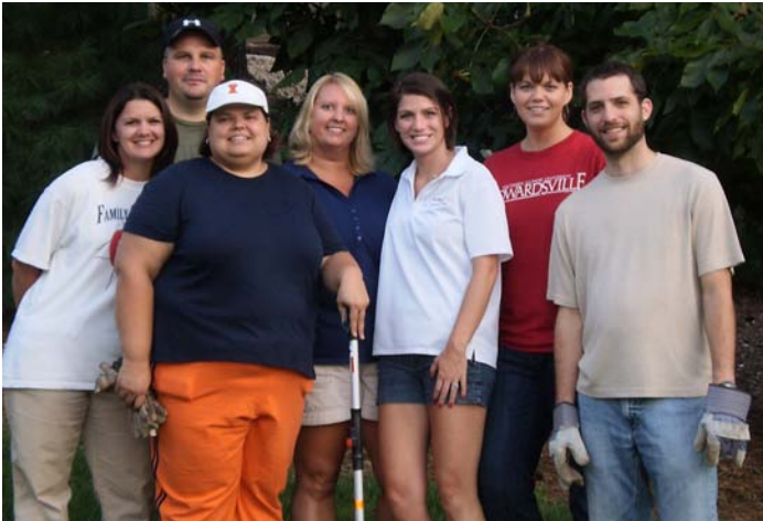
ABOVE: YPG members and guests picked up trash along a 2.5 mile section of Madison County Transit's Nature and Goshen Trails on Thursday, August 26 as part of a new philanthropic initiative for the group.

Speed Networking GC Cuisine 1230 University Drive in Edwardsville