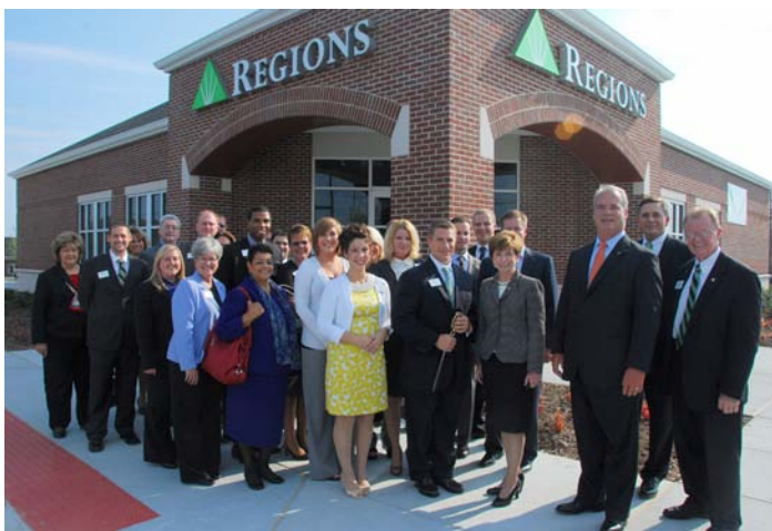
Regions Bank, August 19