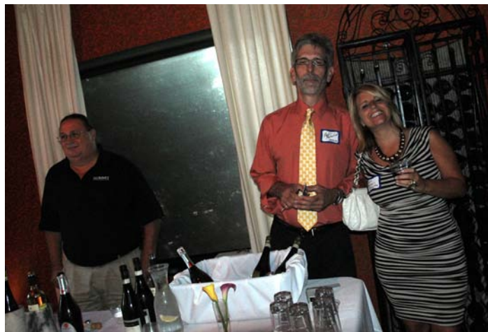
Neruda & BPW, September 2