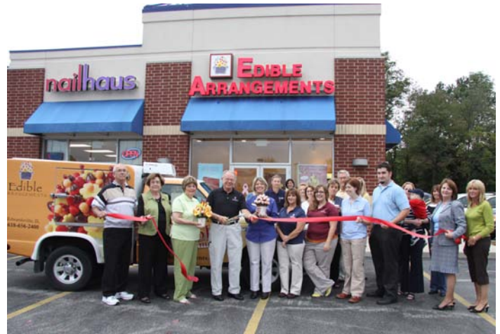
Edible Arrangements, September 24