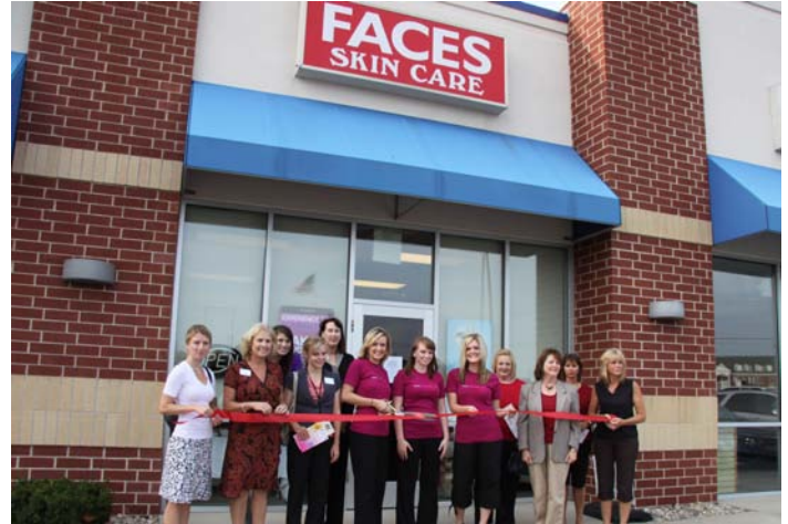
FACES Skin Care, September 16