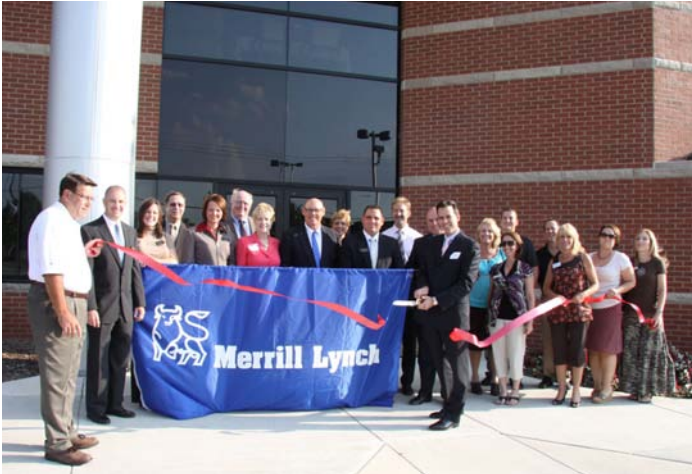
Merrill Lynch, September 9