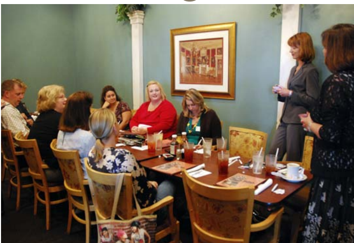
Fountain View Manor, September 11