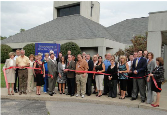
Sleep Center at Edwardsville Health Center (Gateway Regional), Sept. 23