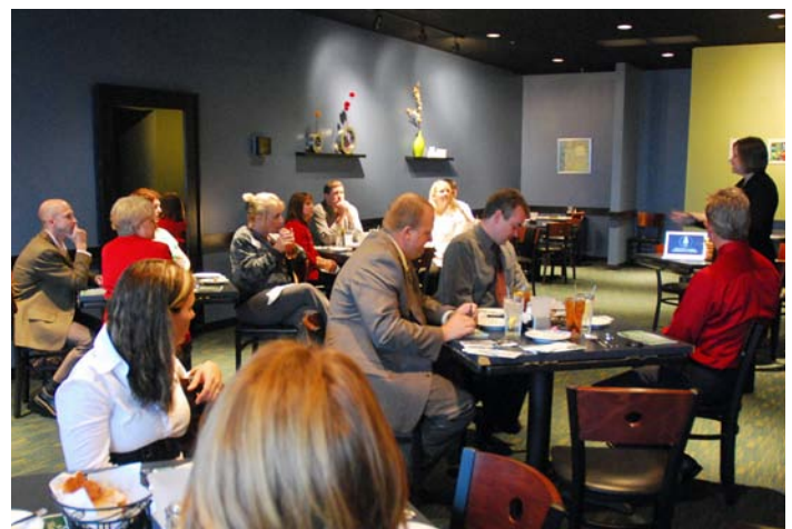
Southern Illinois Chiropractic Center, October 1