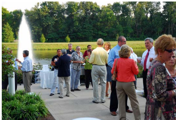
Hortica Insurance & Employee Benefits, September 3