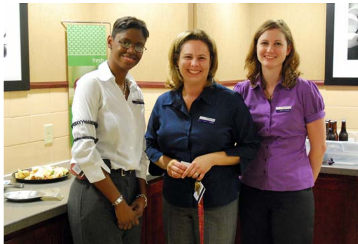
Hampton Inn & Suites, September 17