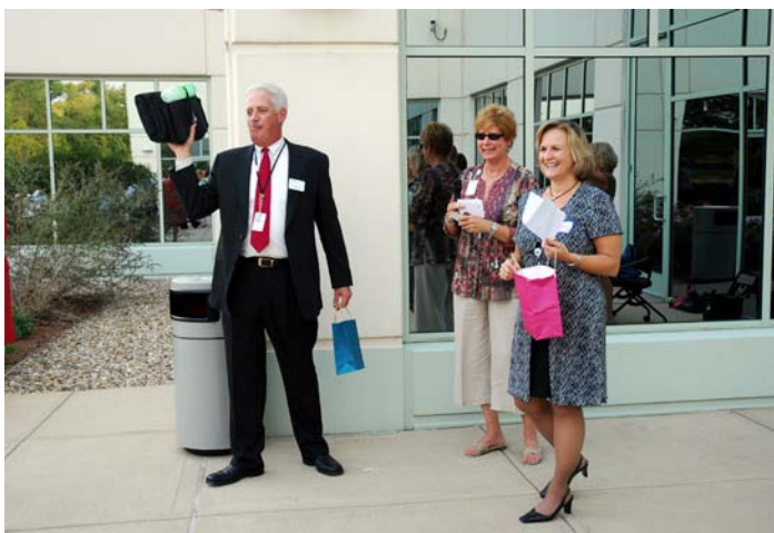
Hortica Insurance & Employee Benefits, September 3