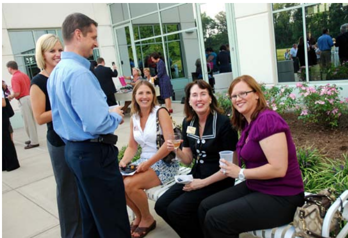
Hortica Insurance & Employee Benefits, September 3