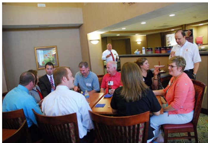
Hampton Inn & Suites, September 17