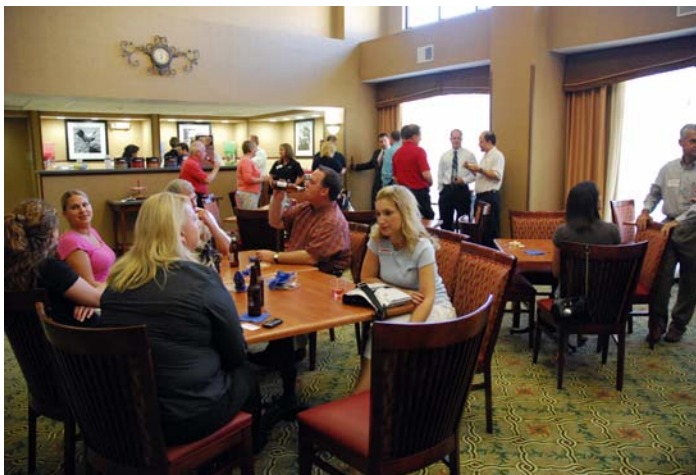
Hampton Inn & Suites, September 17