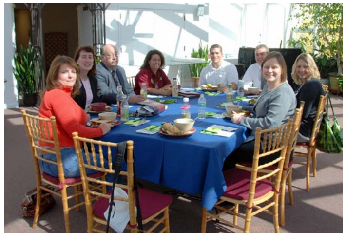
Day & Night Solar, June 18