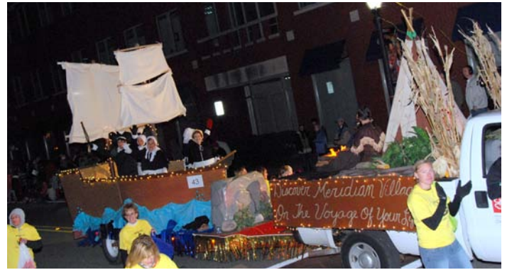
2nd Place Large Non-Profit: Meridian Village