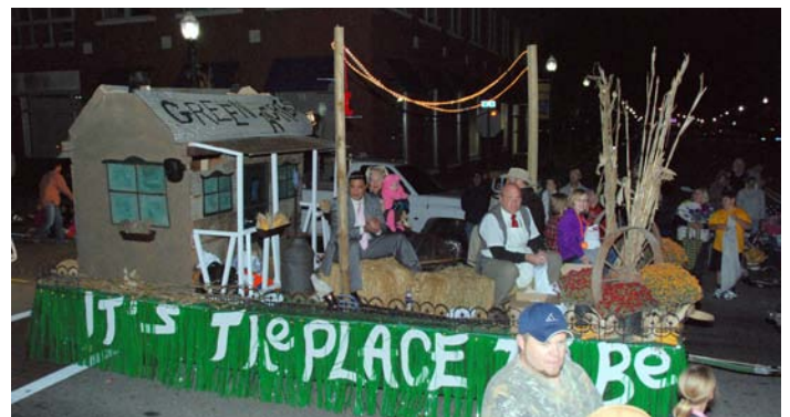
2nd Place Large Commercial: TheBANK of Edwardsville