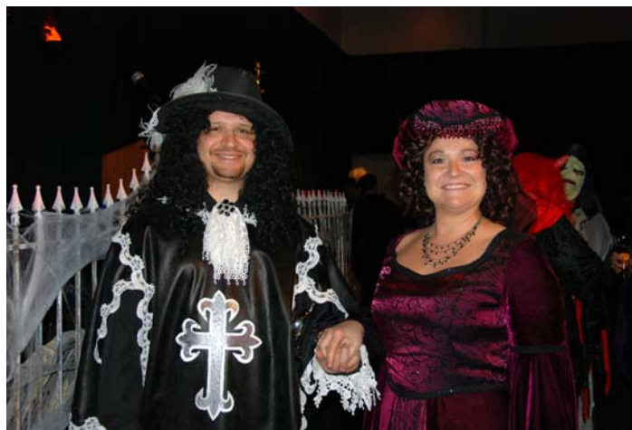
ChamberNet at Gateway Center, October 27