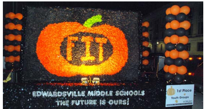
1st Place Neighborhood/Youth Groups: Edwardsville Middle Schools F.I.T.