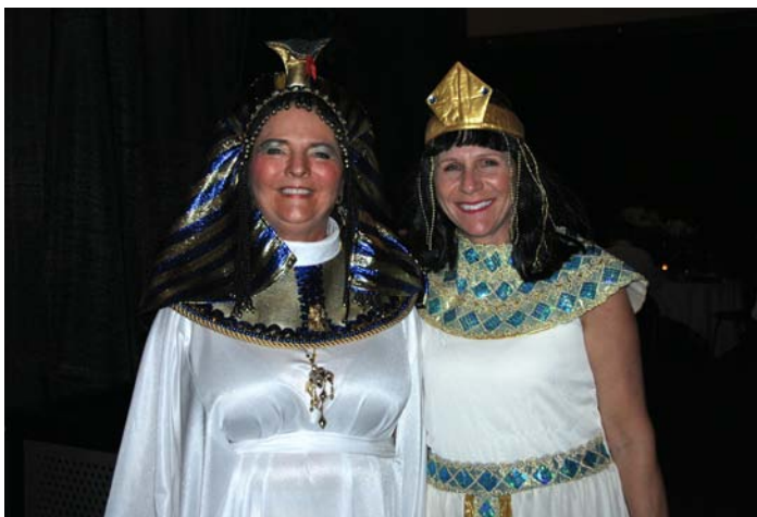
ChamberNet at Gateway Center, October 27