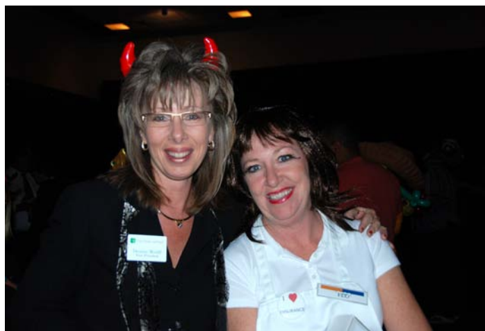
ChamberNet at Gateway Center, October 27