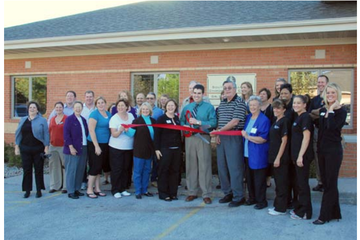
Southern Illinois Chiropractic Center, October 13