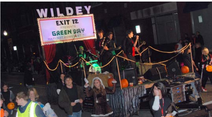
3rd Place Small Commercial: Auto Body Shop