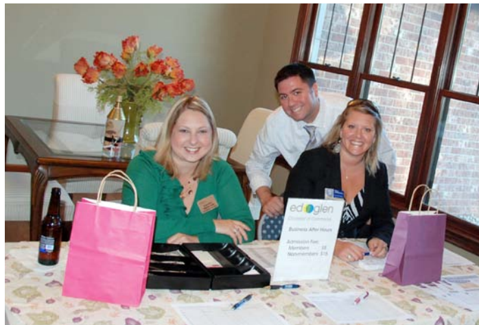
RE/MAX Preferred Partners at Stone Cliff Manor, October 14