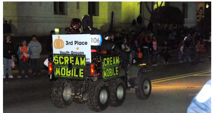
3rd Place Neighborhood/Youth Groups: Scream Mobile

A special thanks to Chamber volunteers, Mojo's Music, Jerry's Tire, American Family Insurance, Royal Solutions LLC, Stunkel Towing, Cable Access TV, the City of Edwardsville, District 7, Edwardsville Rotary & the SIUE Police Department for their continued support of the Halloween Parade. Sponsors of this year's parade were Walmart, Bard & Didriksen Pediatrics, Midwest Sunray Lighting & Sign Maintenance Company, and First Clover Leaf Bank.