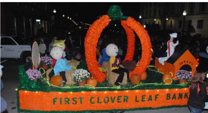
1st Place Large Commercial: First Clover Leaf Bank