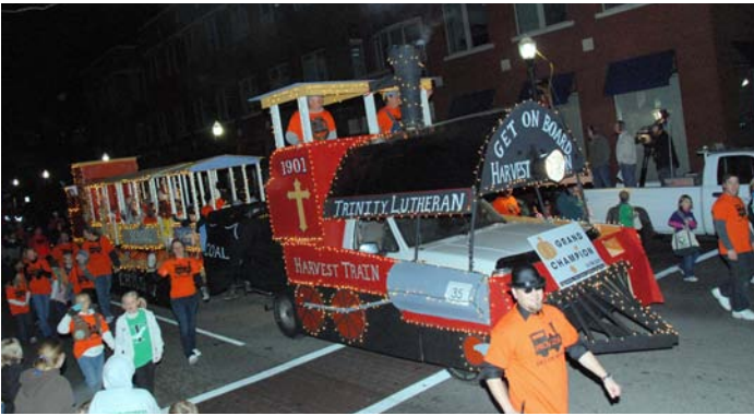
Grand Champion: Trinity Lutheran Church