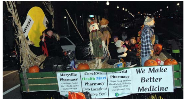
2nd Place Small Commercial: Glen-Ed Pharmacy/Maryville Pharmacy