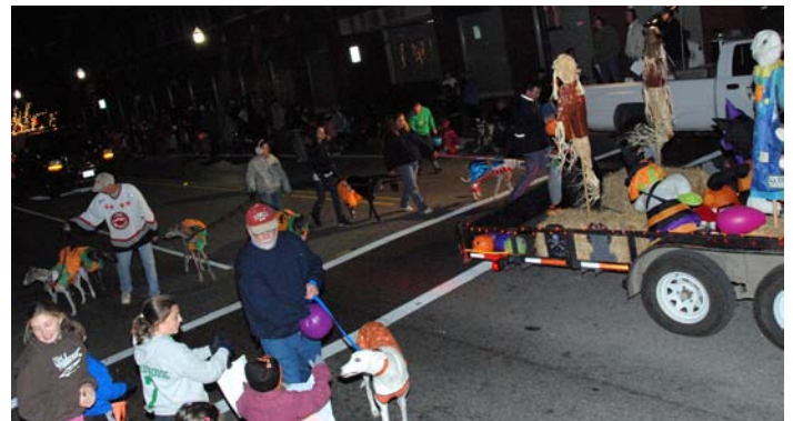
3rd Place Small Non-Profit: REGAP