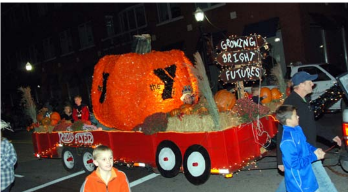
3rd Place Large Non-Profit: Edwardsville YMCA