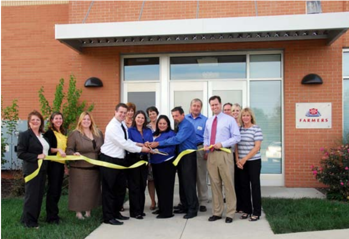
Farmers Insurance District 61, October 13