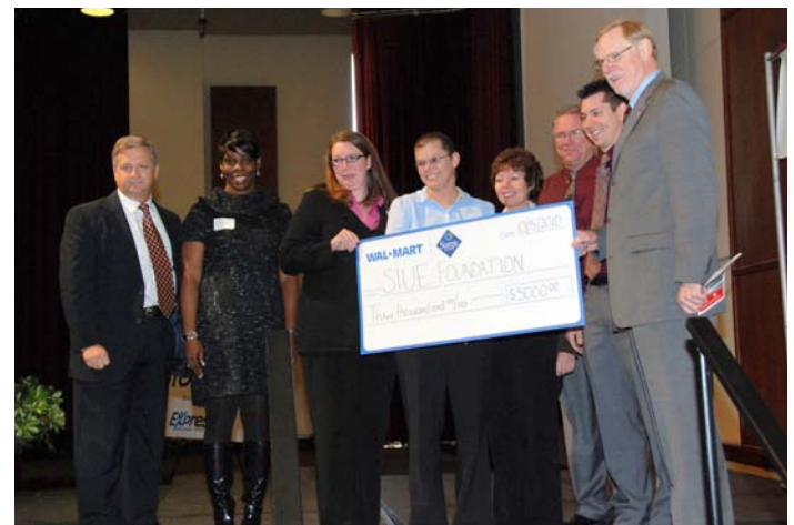
SIUE Day, October 15