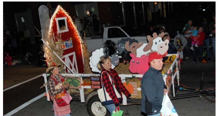
1st Place Small Non-Profit: Glen Carbon Centennial Library