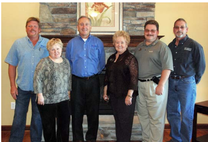
RE/MAX Preferred Partners at Stone Cliff Manor, October 14