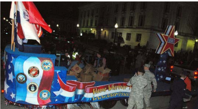
2nd Place Small Non-Profit: USO of Missouri, Inc.