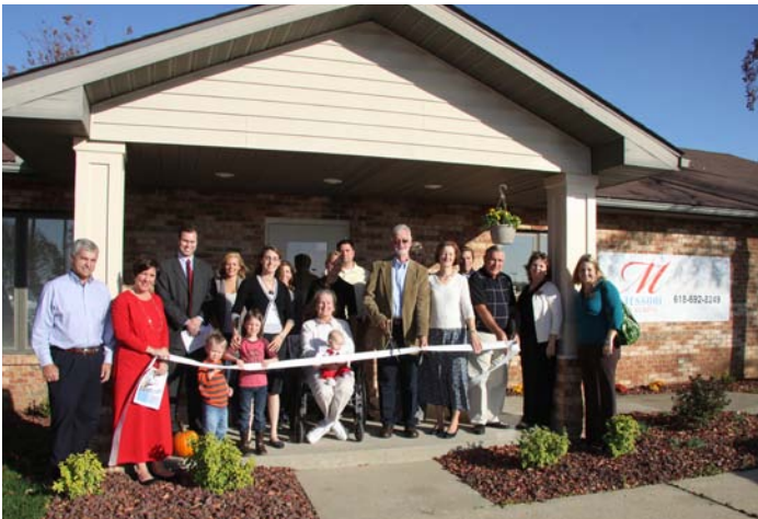
Montessori Glen Ed, October 20