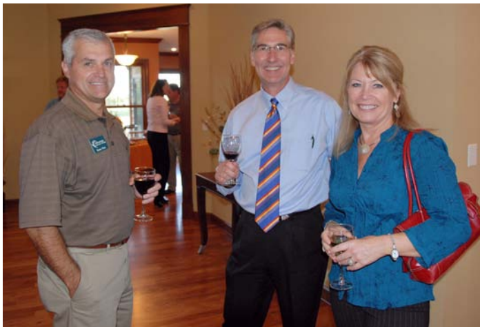
RE/MAX Preferred Partners at Stone Cliff Manor, October 14