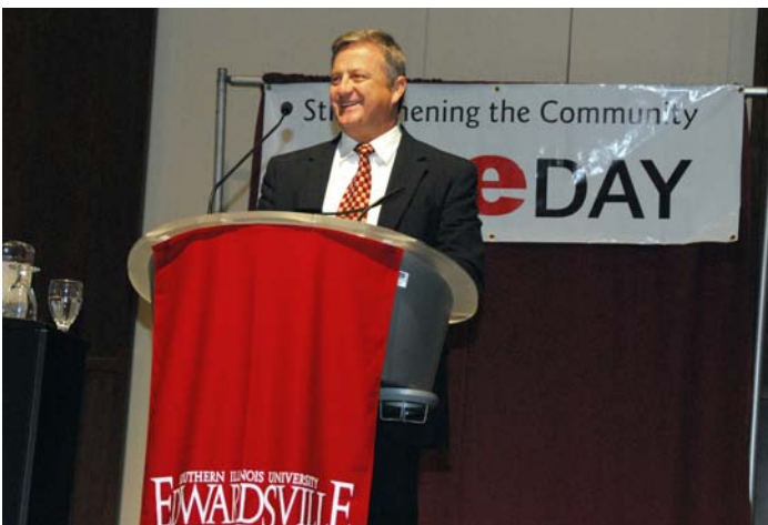
SIUE Day, October 15