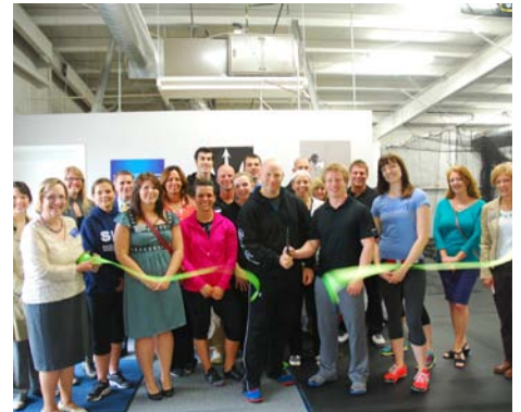
Riverbend CrossFit, April 18