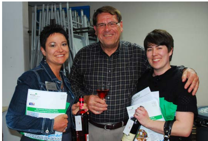
Girl Scouts of Southern Illinois, April 11