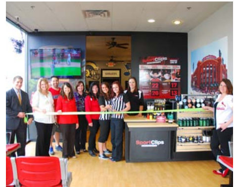
Sport Clips Haircuts, April 8