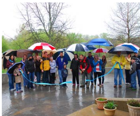
Watershed Nature Center Outdoor Classroom, April 27