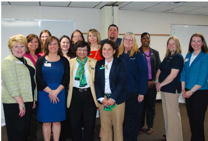
Girl Scouts of Southern Illinois, April 11