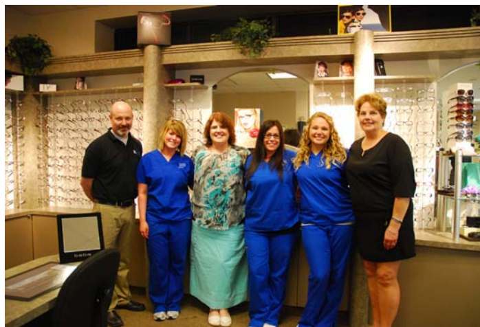
Clarkson Eyecare, April 25