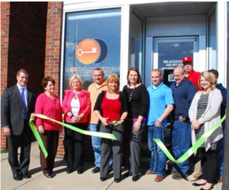
SKD Key Accounting & Tax Services, April 1