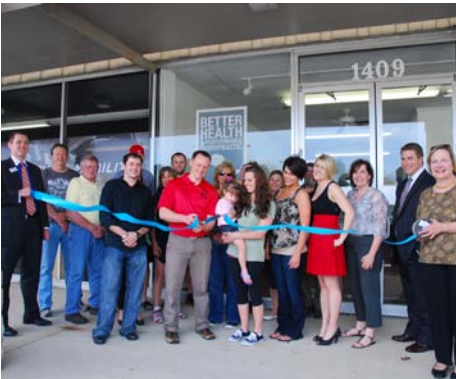
Better Health & Performance Chiropractic, April 10