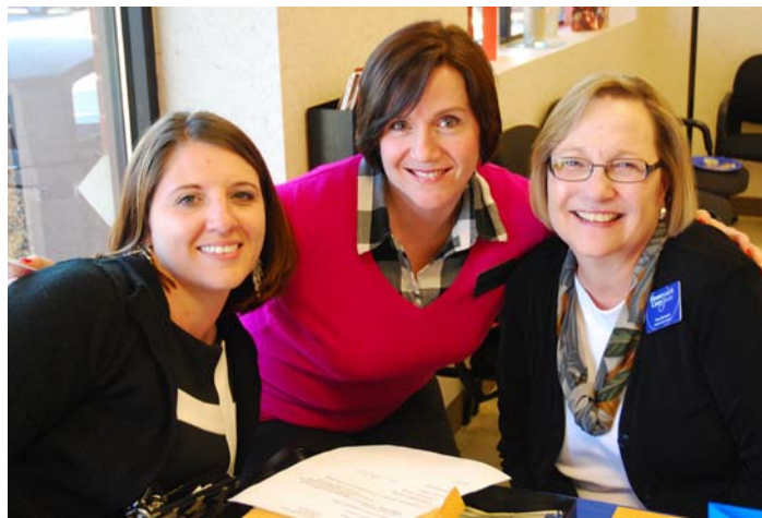
Clarkson Eyecare, April 25