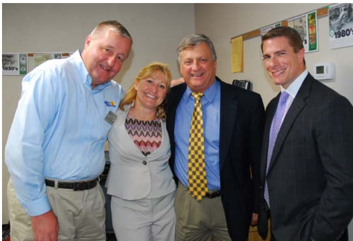
Girl Scouts of Southern Illinois, April 11