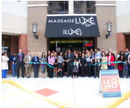
MassageLuXe, April 12