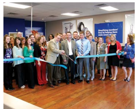
Sam's Club Hiring & Membership Facility, April 30