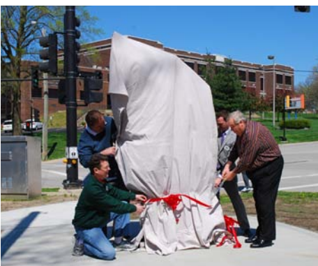
City of Edwardsville Route 66 Kiosk, April 20