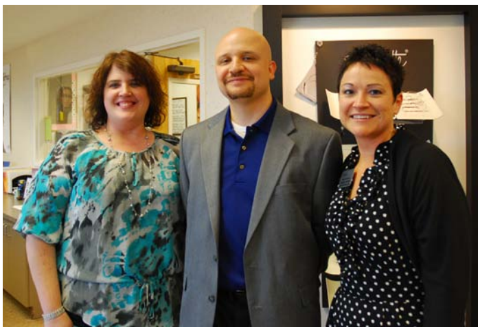
Clarkson Eyecare, April 25