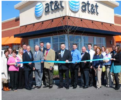
AT&T Corporate Store, April 5