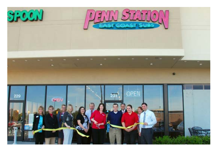
Penn Station, April 12