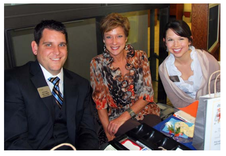
Patriot Sunrooms East, April 5