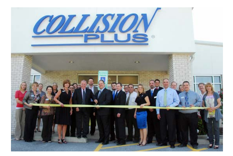
Collision Plus of Glen Carbon, April 26