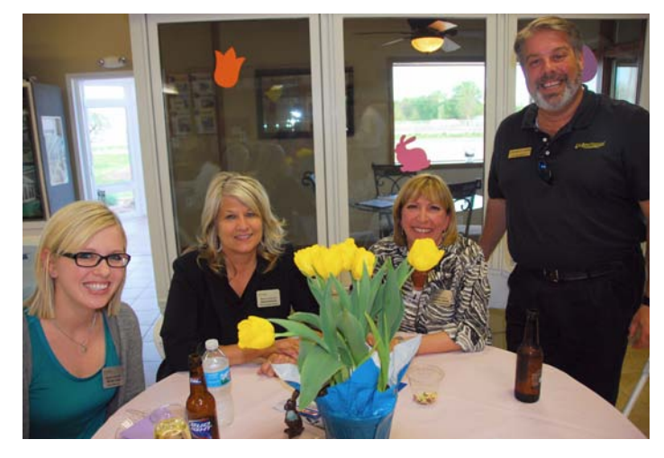
Patriot Sunrooms East, April 5