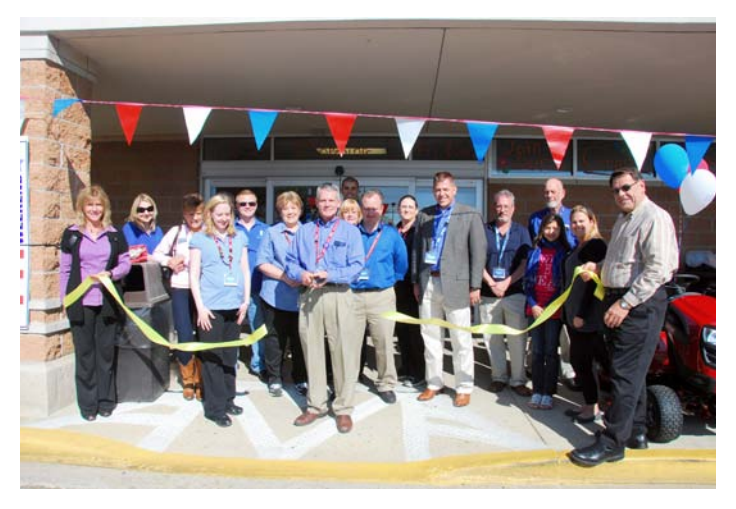
Sears Hardware, April 6