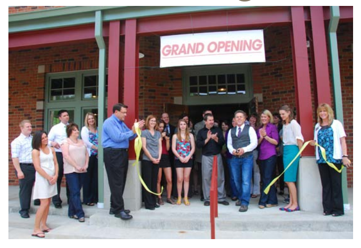
Sips n Splatters, April 4