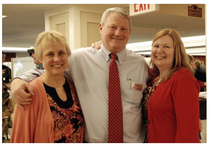
Eden Village, April 28