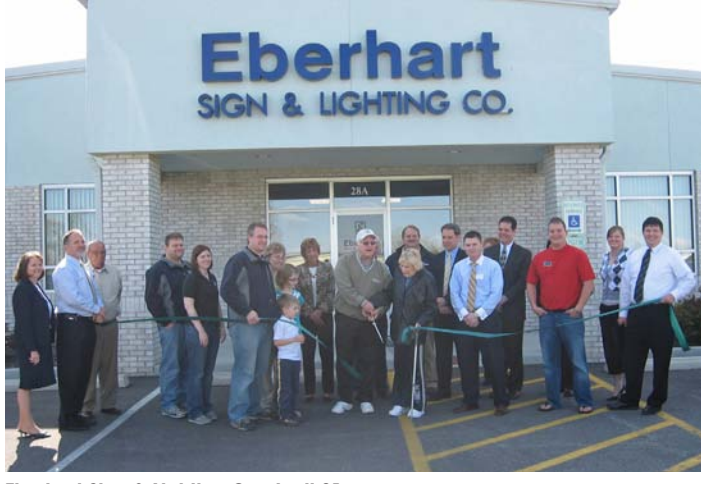
Eberhart Sign & Lighting Co., April 21