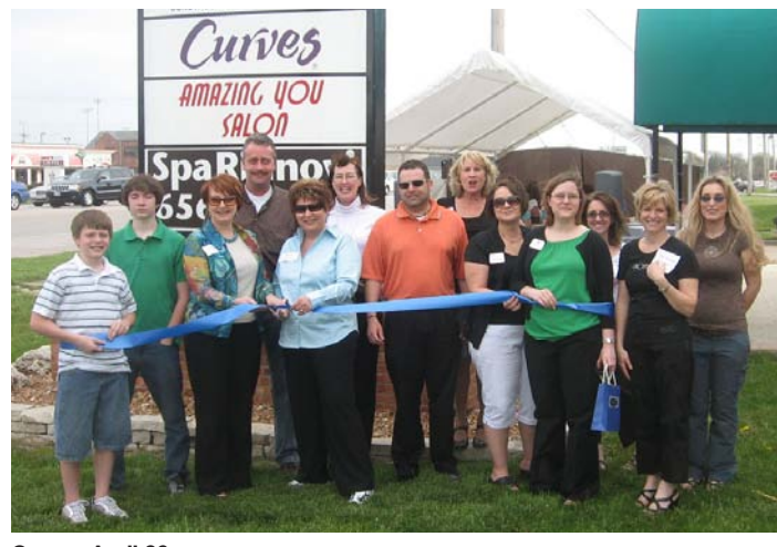
Curves, April 23