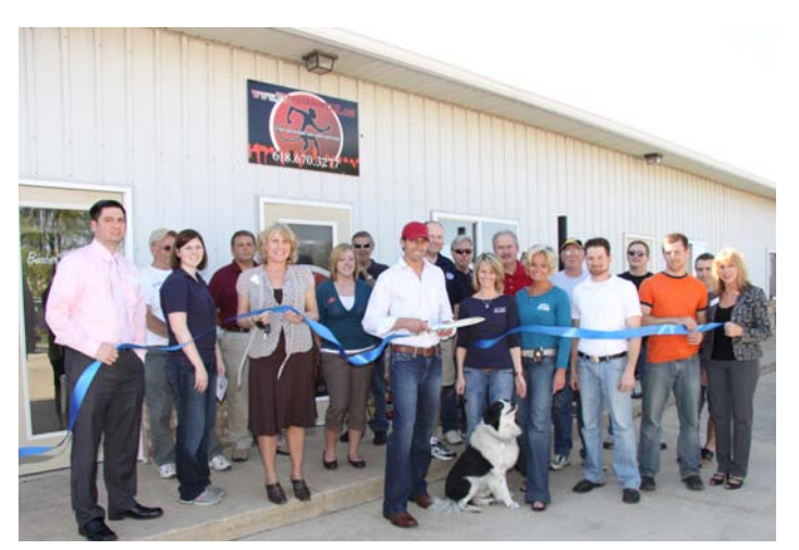
Evolution Detail, April 22