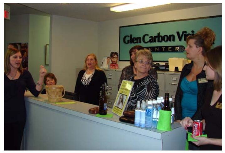
Glen Carbon Vision Center, April 16