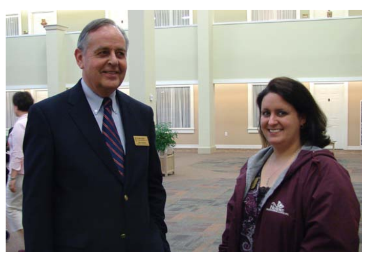
Eden Village Retirement Community, April 2