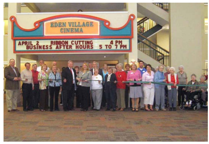
Eden Village, April 2