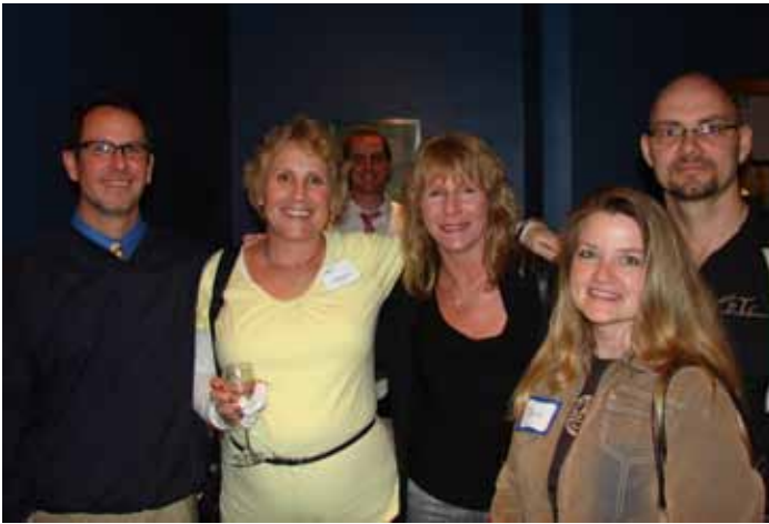
Bella Milano, April 3