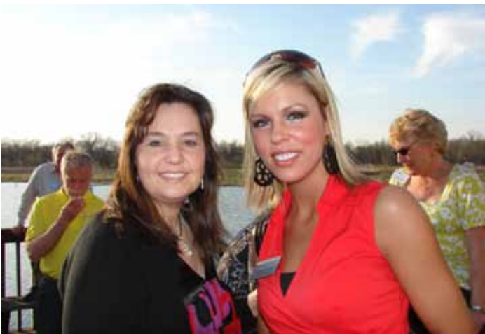
Watershed Nature Preserve, April 17