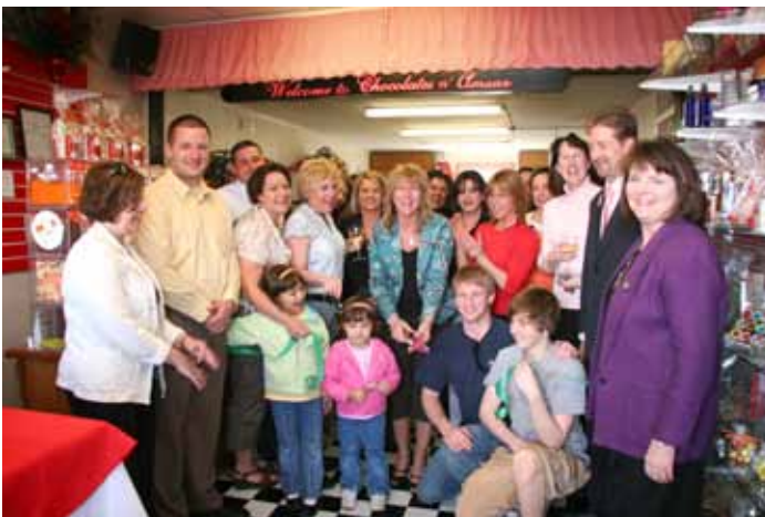
Chocolates N'Amour, April 16