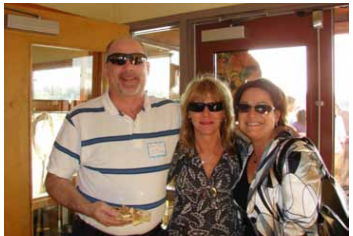
Watershed Nature Preserve, April 17