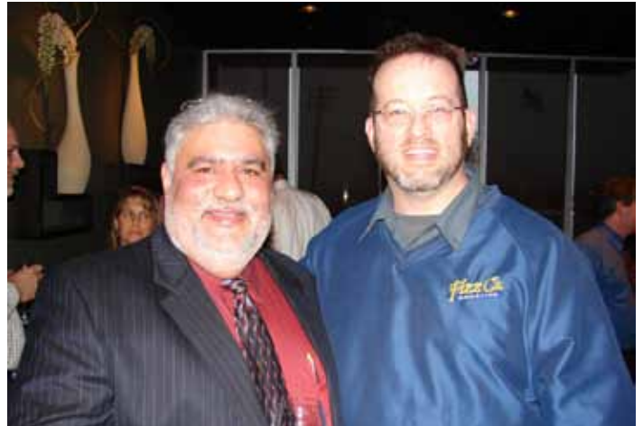
Bella Milano, April 3