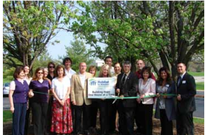
Habitat for Humanity, April 23