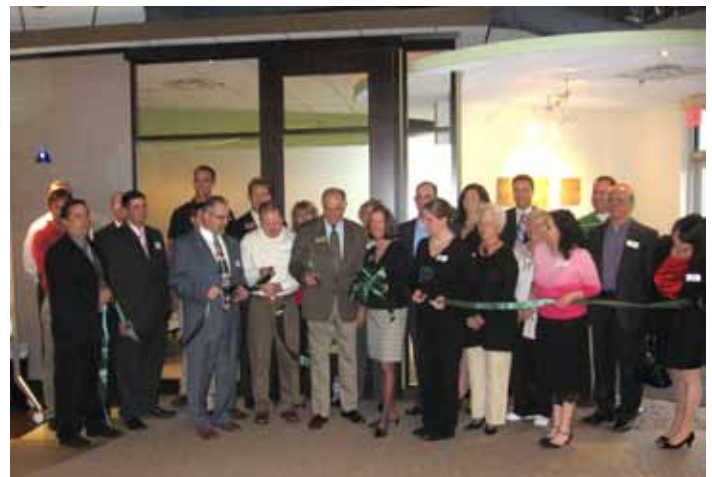
Louer Facility Planning, April 10