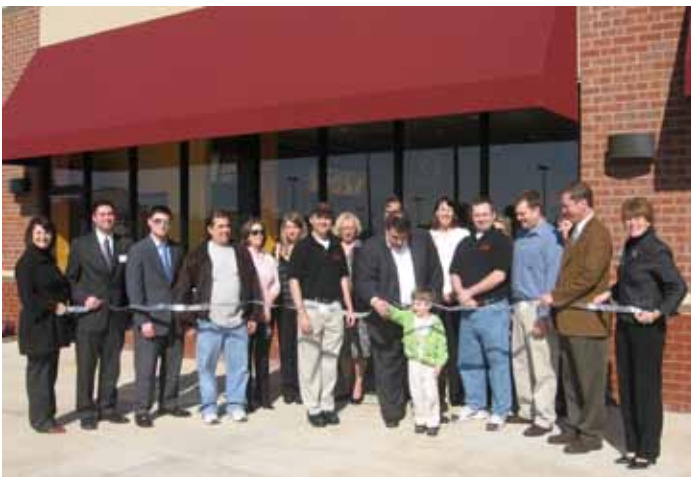
Noble Roman's Pizza of Edwardsville, April 29