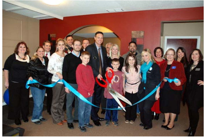
Ooh La La Spa, Anti-Aging & Wellness, February 20