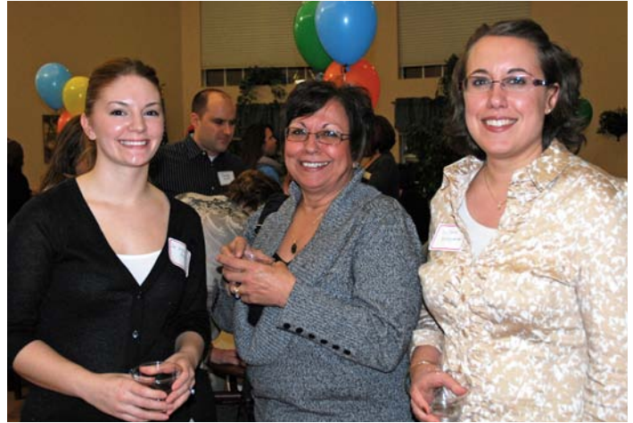
February 28, Meridian Village