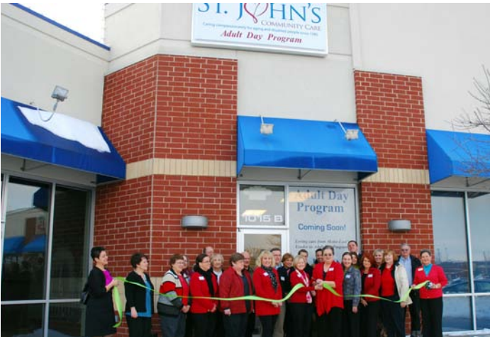
St. John's Community Care Adult Day Program, February 22