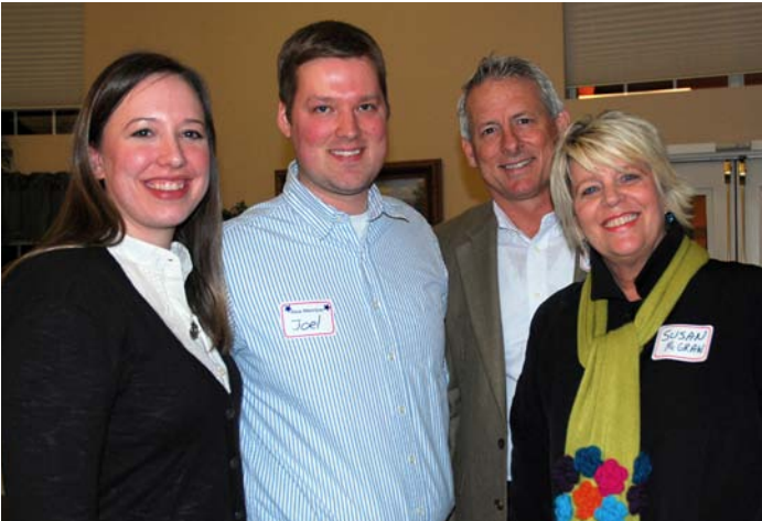
February 28, Meridian Village