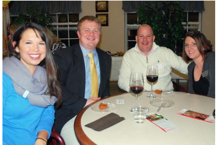
February 28, Meridian Village