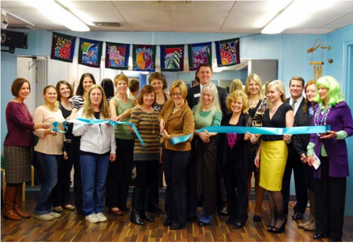
Studio GAIA, February 7