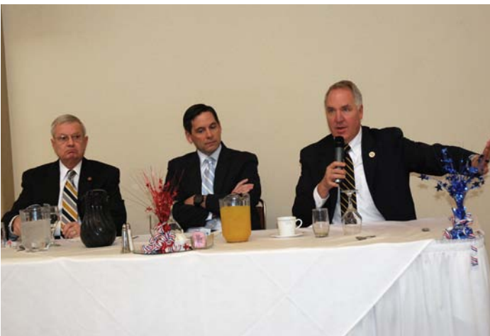
Government Affairs Committee Legislative Summit, February 25