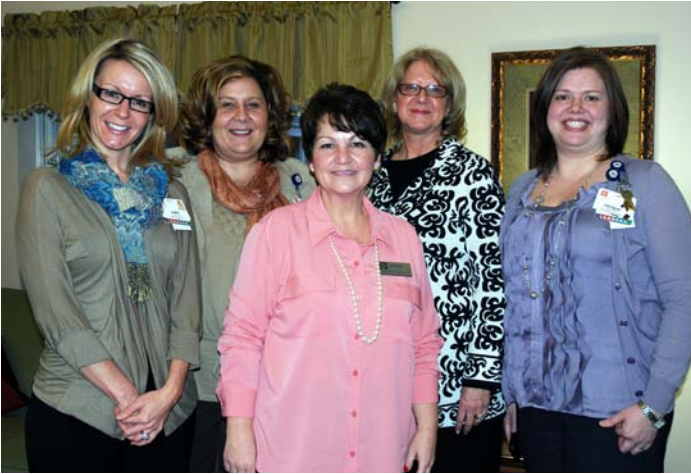
February 28, Meridian Village