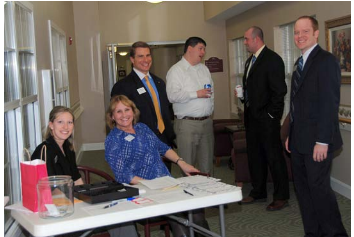
Meridian Village, February 17