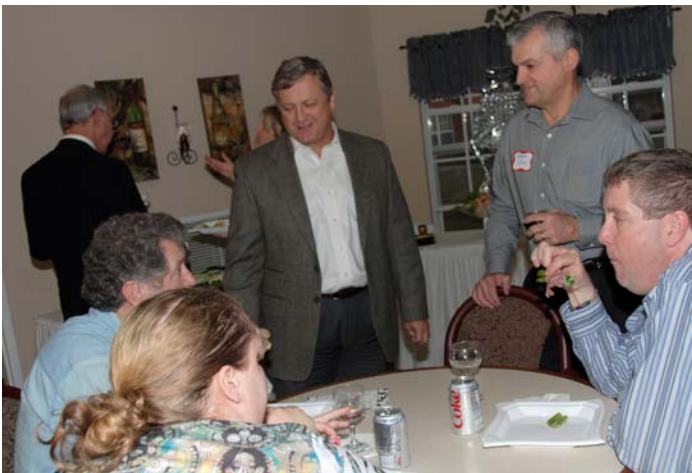
Meridian Village, February 17