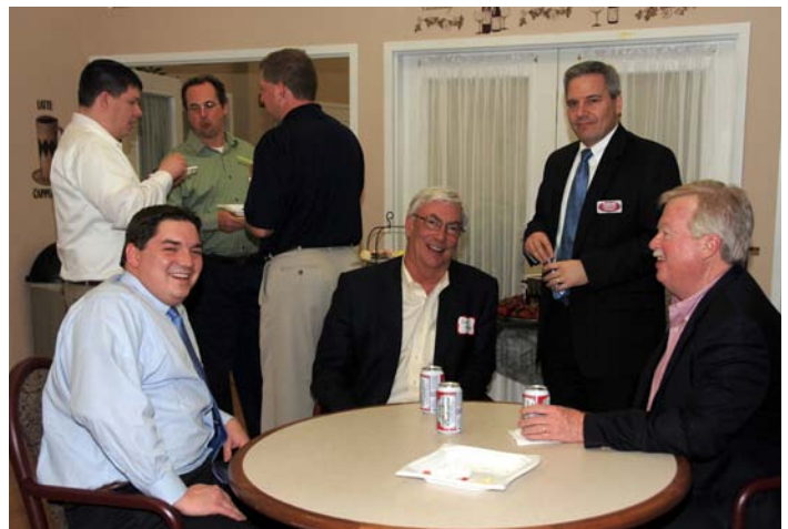
Meridian Village, February 17