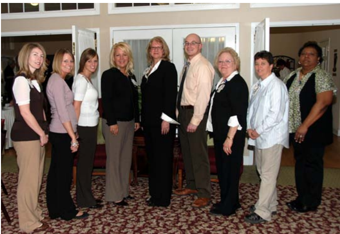
Meridian Village, February 17