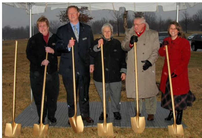
Scott Credit Union, February 24