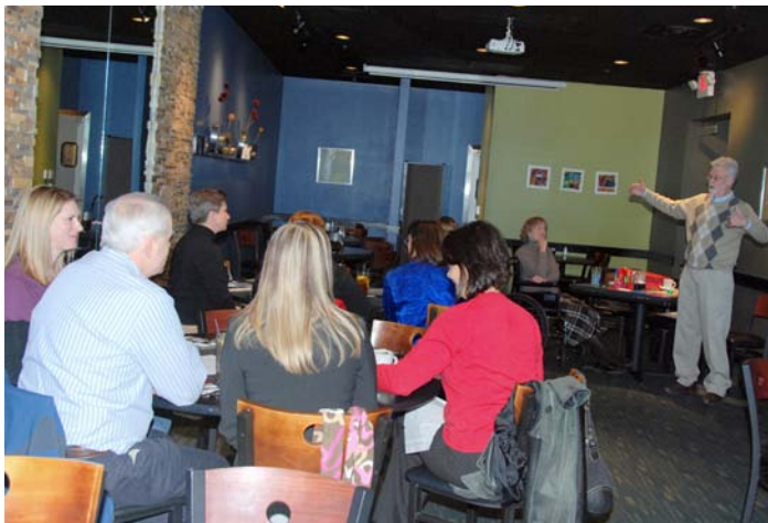
Montessori Glen-Ed, February 11