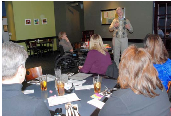
Montessori Glen-Ed, February 11