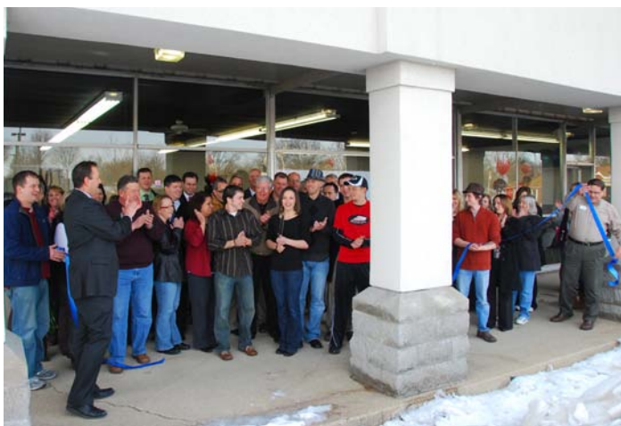
Accelerate: Health & Fitness Consulting, February 10