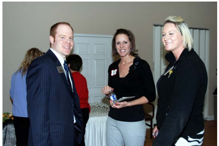
Meridian Village, February 17