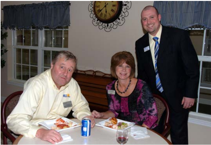
Meridian Village, February 17