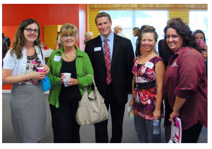
Hot Yoga, May 31