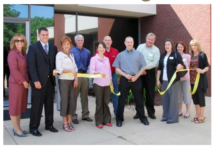
Madison County Computer & LAN Services, May 10