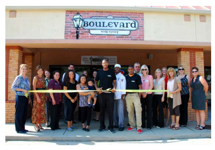
The Boulevard Wing Street, May 24