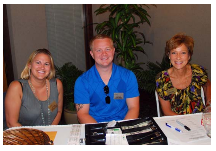
Balke Brown Transwestern and Sandberg, Phoenix & von Gontard, May 17