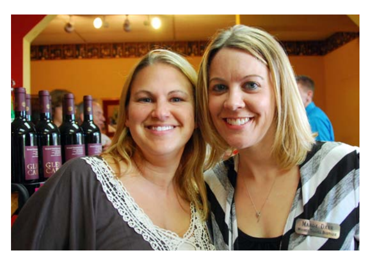
Crushed Grapes, Catered AFFAIR & American Family Insurance, May 3