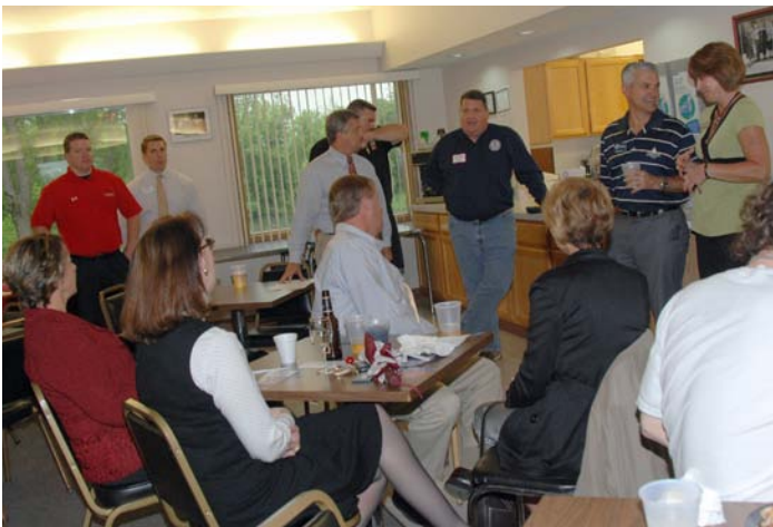
Edwardsville Gun Club & Captain Hog's BBQ, May 26