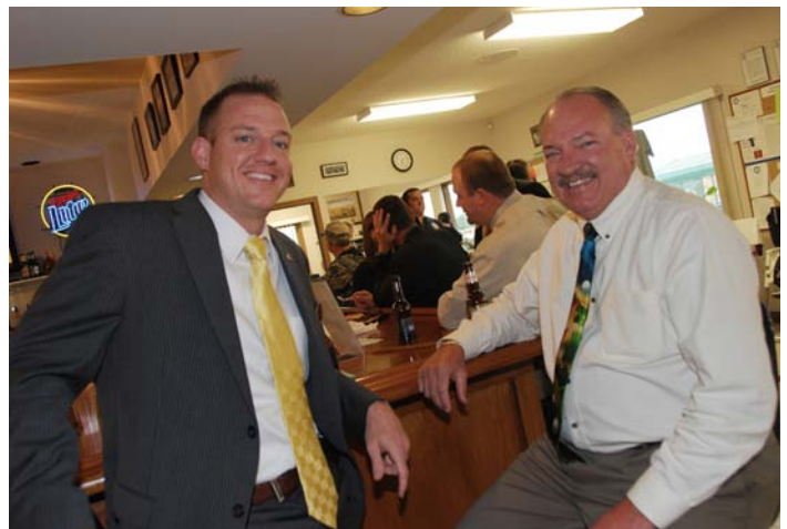
Edwardsville Gun Club & Captain Hog's BBQ, May 26