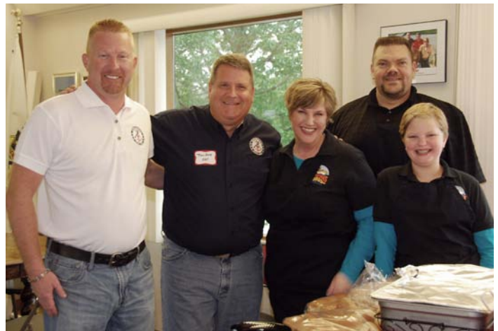
Edwardsville Gun Club & Captain Hog's BBQ, May 26