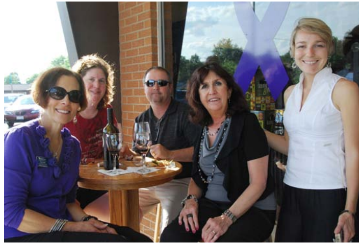
Crushed Grapes, American Family Insurance & Catered AFFAIR, May 12