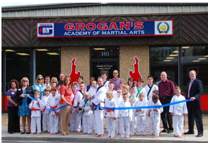
Grogan's Academy of Martial Arts, May 18