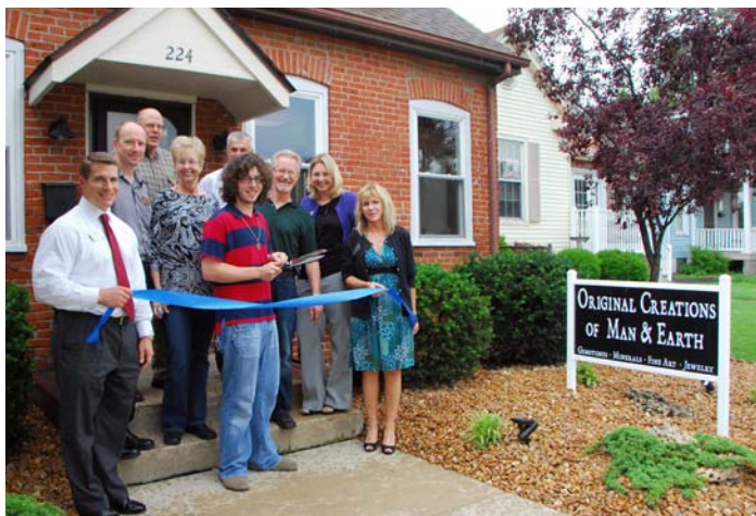
Original Creations of Man & Earth, May 25