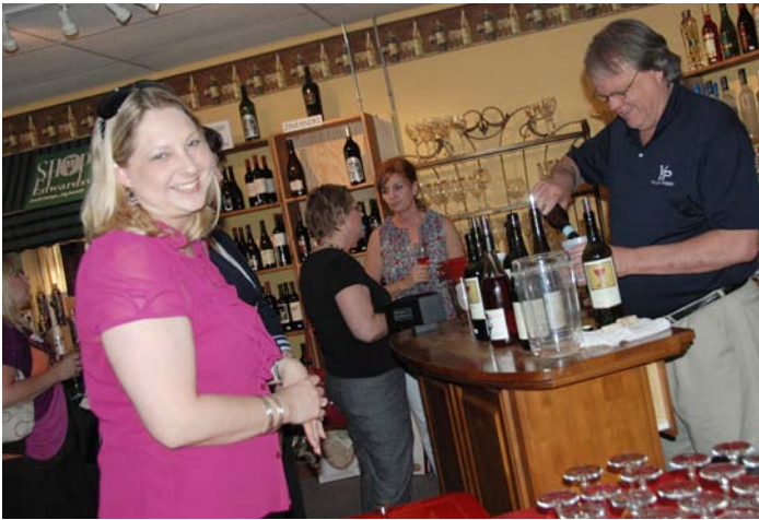
Crushed Grapes, American Family Insurance & Catered AFFAIR, May 12