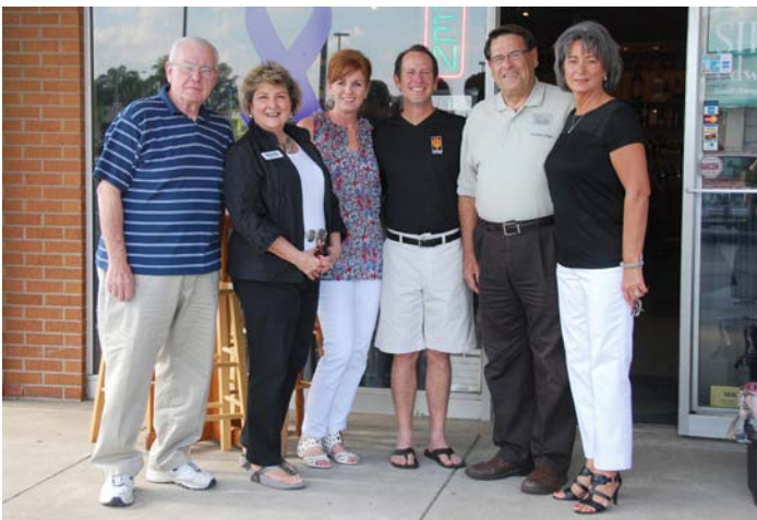
Crushed Grapes, American Family Insurance & Catered AFFAIR, May 12