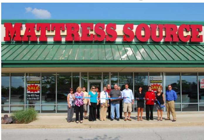
Mattress Source, May 11