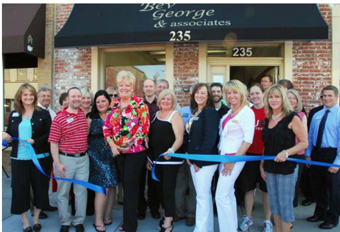
Bev George & Associates, May 24