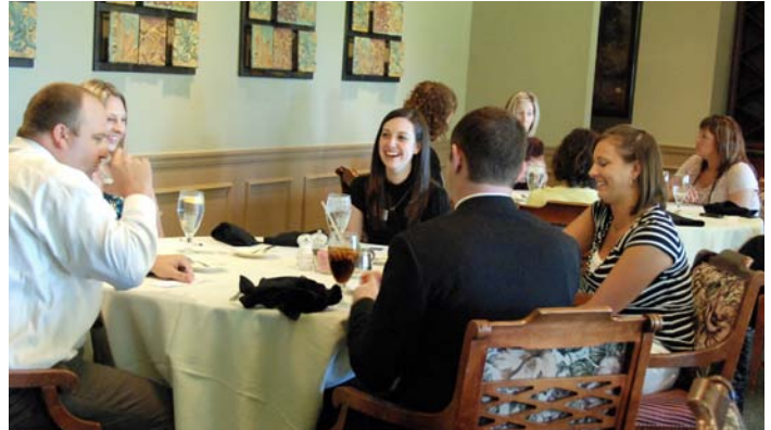
ABOVE: YPG Speed Networking was held May 24 at Sunset Hills Country Club. Nearly 20 young professionals gathered to participate in casual networking and enjoy an Italian lunch buffet.