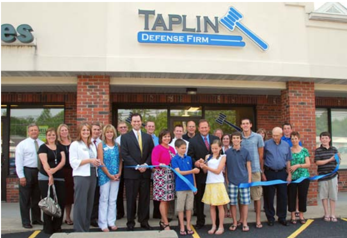
Taplin Defense Firm, June 8