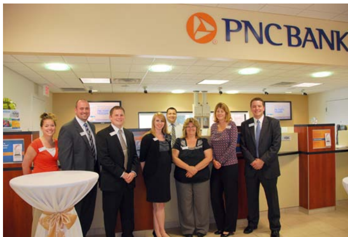
PNC Bank, June 23