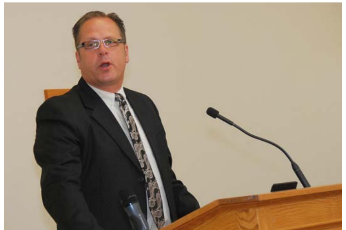
Mayors' Breakfast, June 9