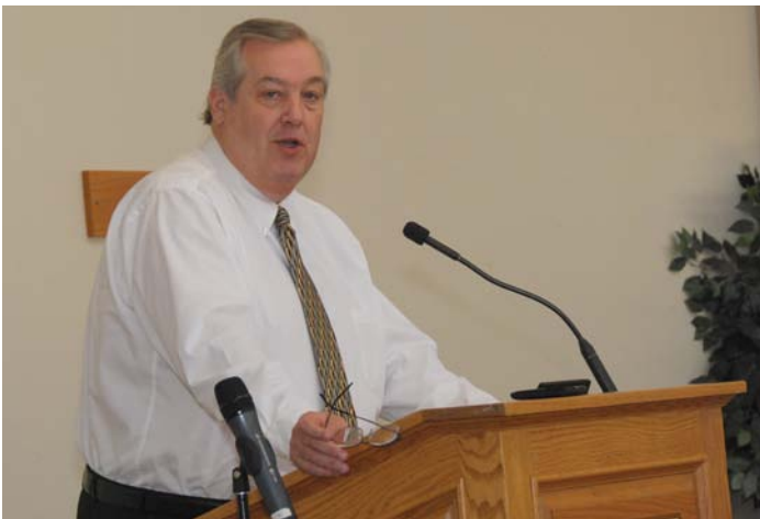
Mayors' Breakfast, June 9