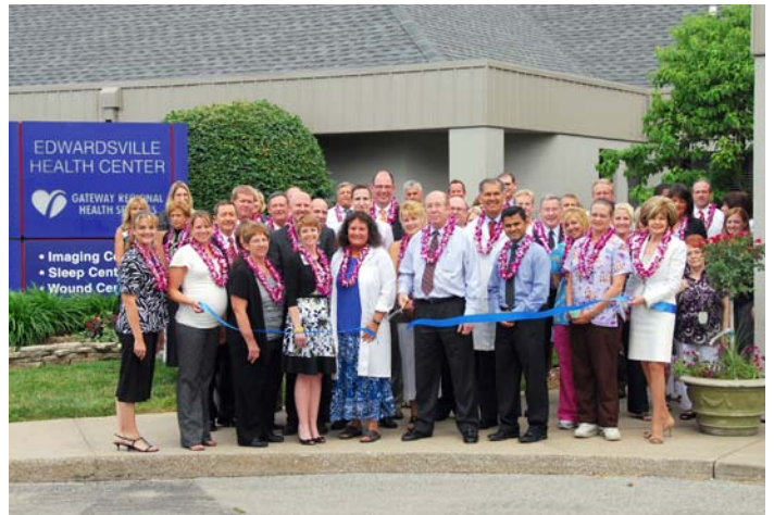
Gateway Regional Medical Center's Wound Center, June 22