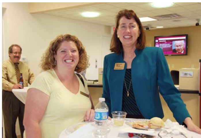
PNC Bank, June 23