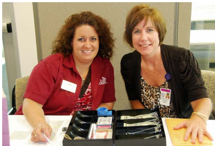
PNC Bank, June 23