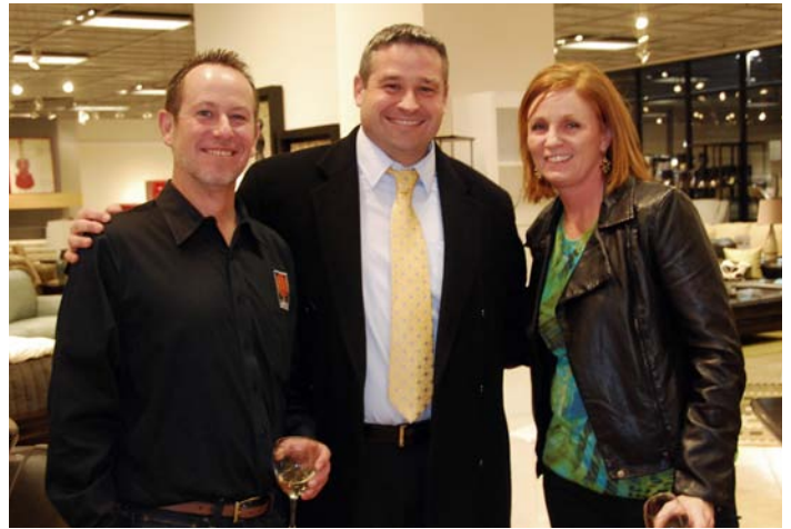
Ashley Furniture, January 6