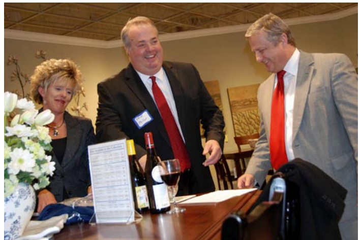
Ashley Furniture, January 6