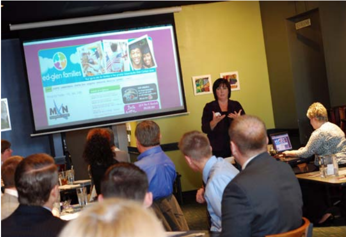
ed-glen families, January 14