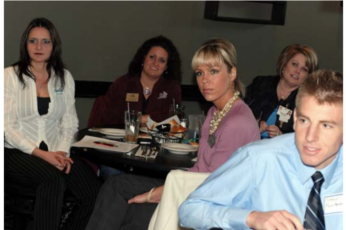
ed-glen families, January 14