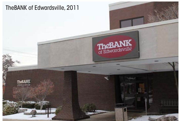
TheBANK of Edwardsville, 2011

TheBANK of Edwardsville has been a Chamber member since 1954, and values its Chamber membership and benefits. Through the Chamber, TheBANK has been able to stay better connected with commercial banking customers in the area. TheBANK's membership has also been useful in networking and keeping up to date with the communities needs.