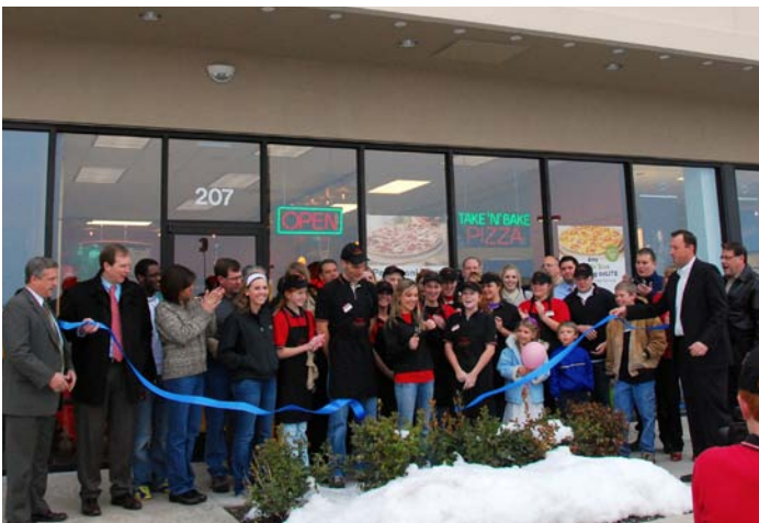
Papa Murphy's Take 'N' Bake Pizza, January 27