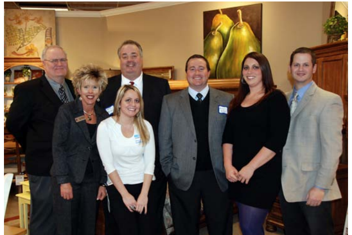
Ashley Furniture, January 6