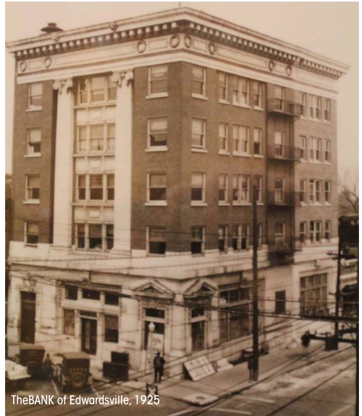
TheBANK of Edwardsville, 1925

Through its distinguished Community Scholarship Program, TheBANK of Edwardsville awards one select graduating high school senior with $2,000 per four years in scholarship money. This student exhibits positive leadership and character through community involvement and academic accomplishment.