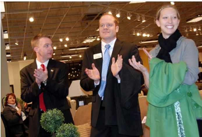
Ashley Furniture, January 6