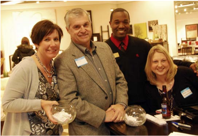
Ashley Furniture, January 6