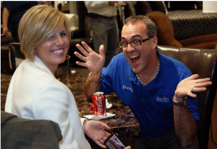
Ashley Furniture, January 6