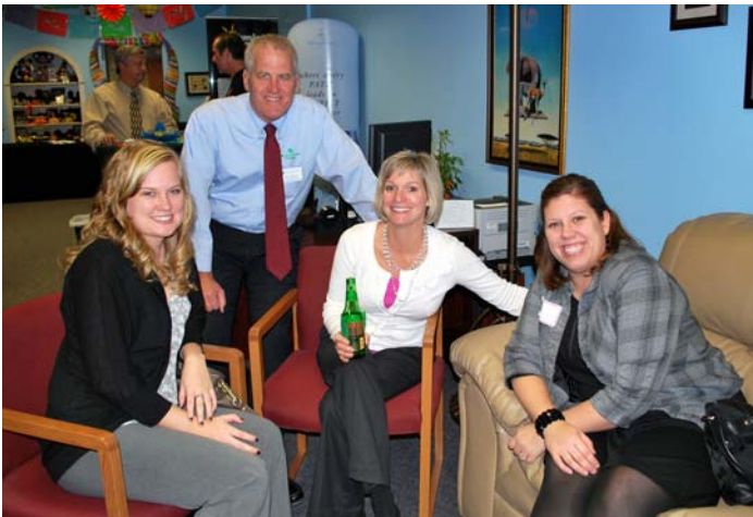
Travel Express, November 1