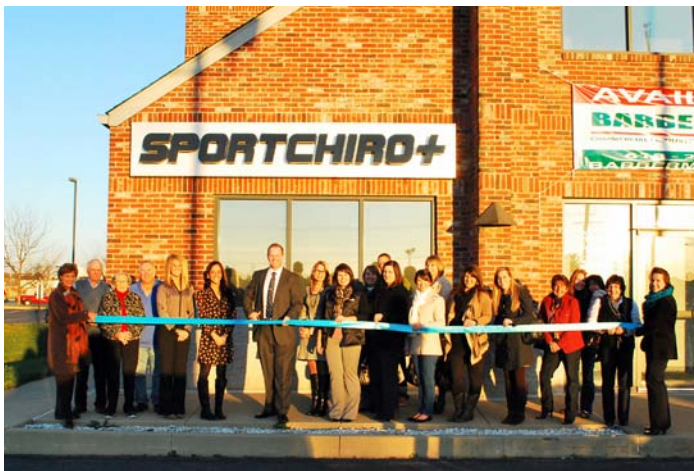
SPORTCHIRO+, November 14