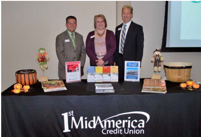
November 15, Credit Union Co-Op: 1st MidAmerica Credit Union