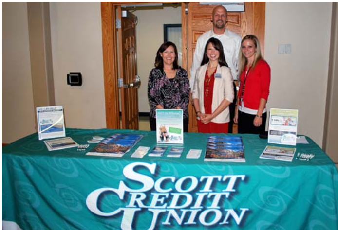
November 15, Credit Union Co-Op: Scott Credit Union