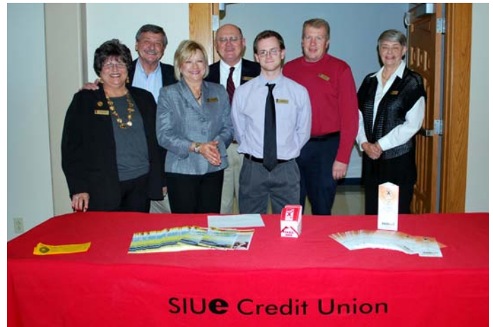
November 15, Credit Union Co-Op: SIUE Credit Union