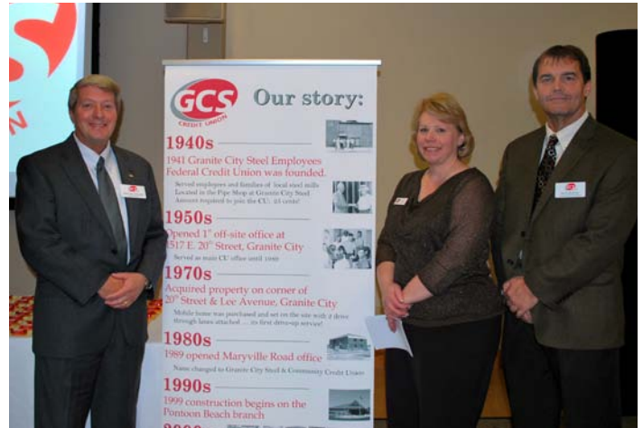
November 15, Credit Union Co-Op: GCS Credit Union