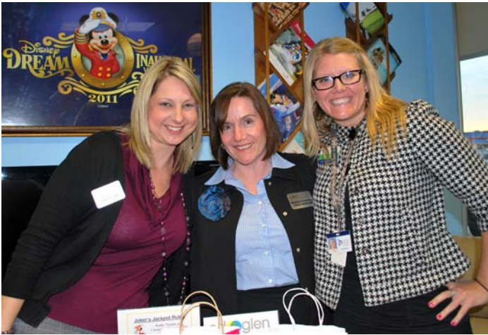
Travel Express, November 1