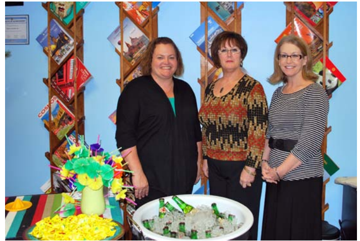
Travel Express, November 1