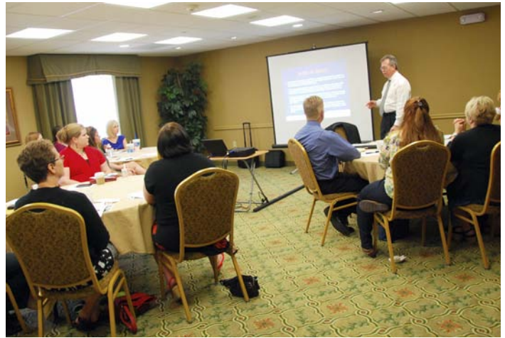
Employment Relationship in the Age of Social Media, July 24