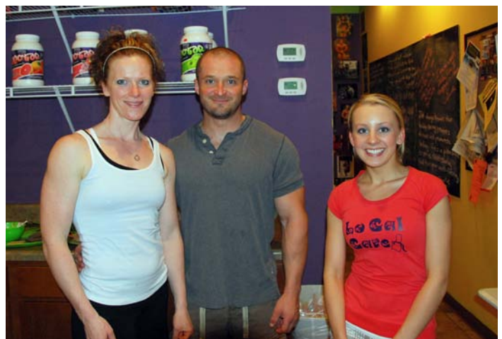
July 12, Lo-Cal Cafe