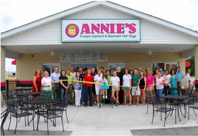
Annie's Frozen Custard, July 21