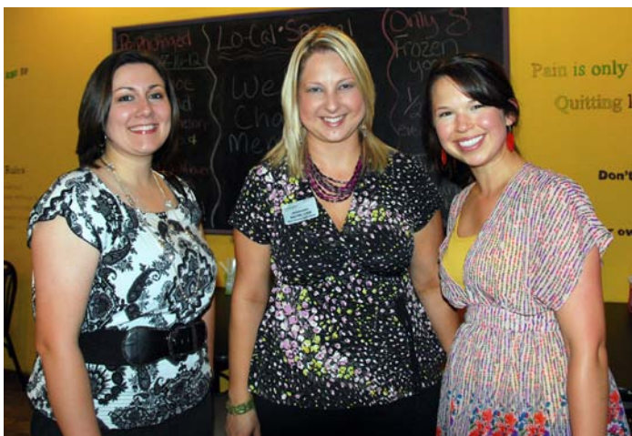
July 12, Lo-Cal Cafe