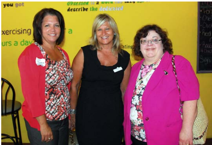
July 12, Lo-Cal Cafe