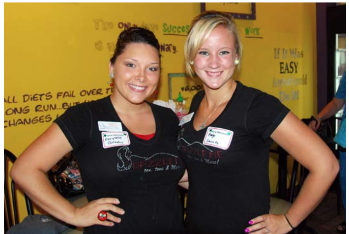
July 12, Lo-Cal Cafe