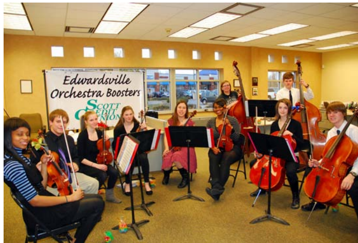
Scott Credit Union, March 14