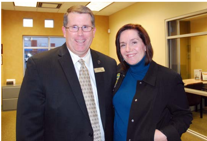
Scott Credit Union, March 14