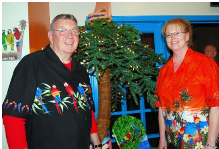
Tropical Escape Tiki Bar & Grill, March 28