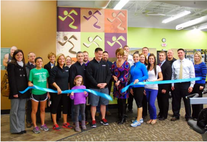
Anytime Fitness, March 5