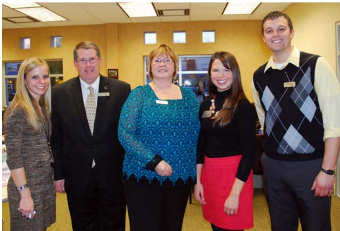
Scott Credit Union, March 14