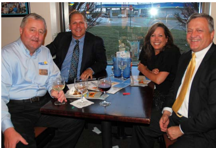
Edwardsville Intelligencer / Tropical Escape Tiki Bar & Grill, March 28