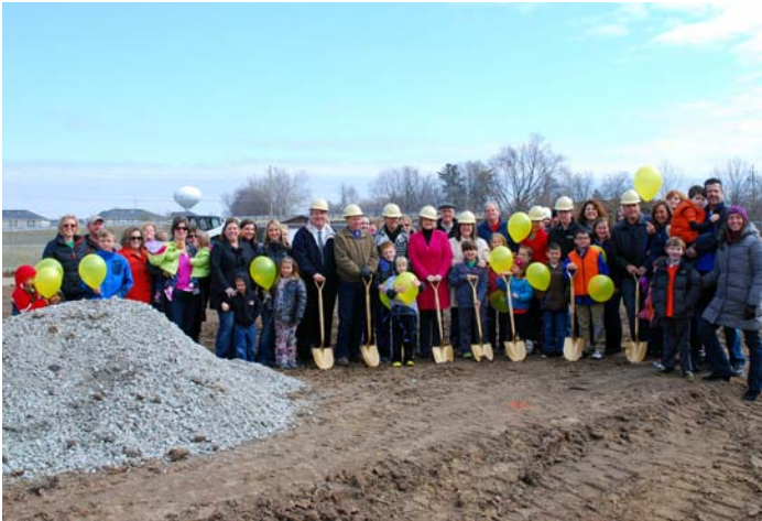
Junior Service Club Boundless Playground at Township Park, March 23