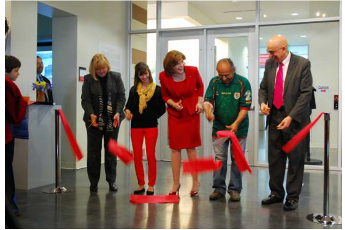
SIUE Department of Art & Design Building, March 21