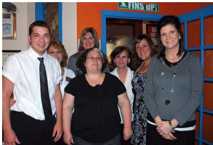
Tropical Escape Tiki Bar & Grill, March 28