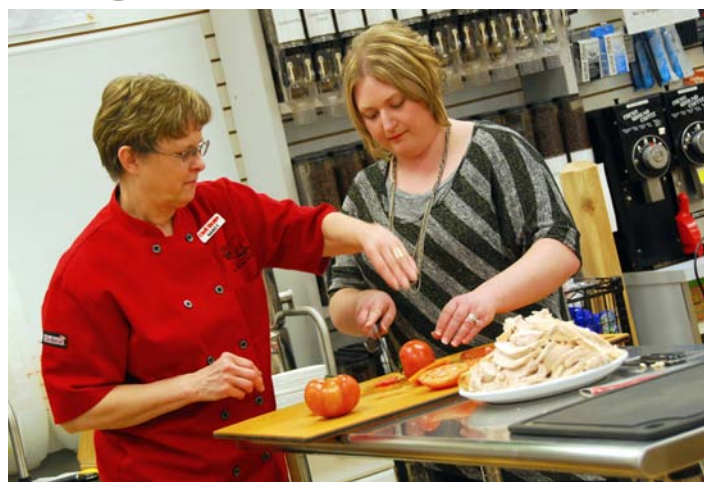
Young Professionals Group Knife Skills Class at Chef's Shoppe, March 15