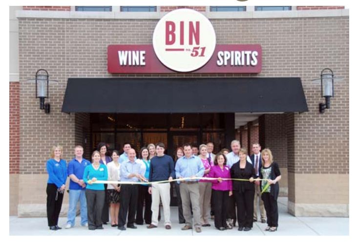
Bin 51 Wine & Spirits, March 7