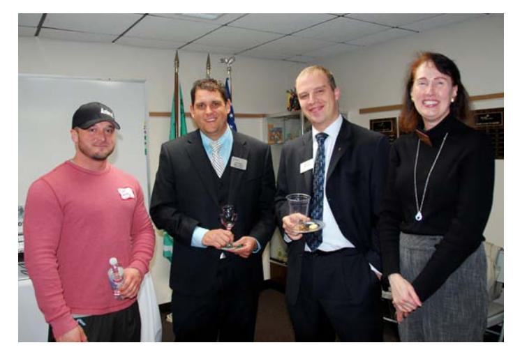
Girl Scouts of Southern Illinois, March 8