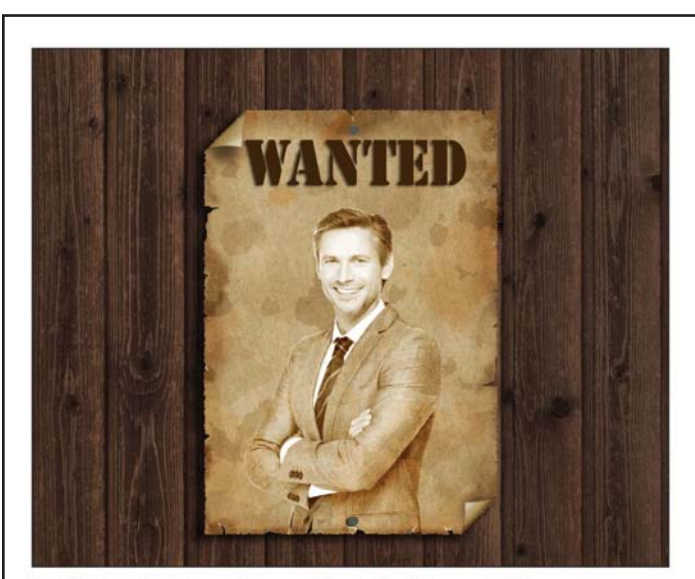
WANTED: Emotionally Intelligent Managers