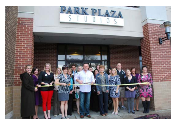
DMWII Salon @ Park Plaza, March 22