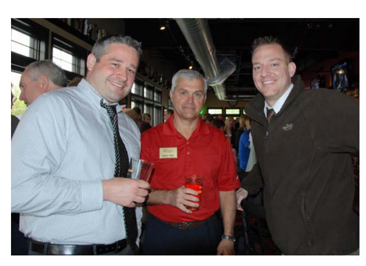
Global Brew Tap House & Lounge, March 22