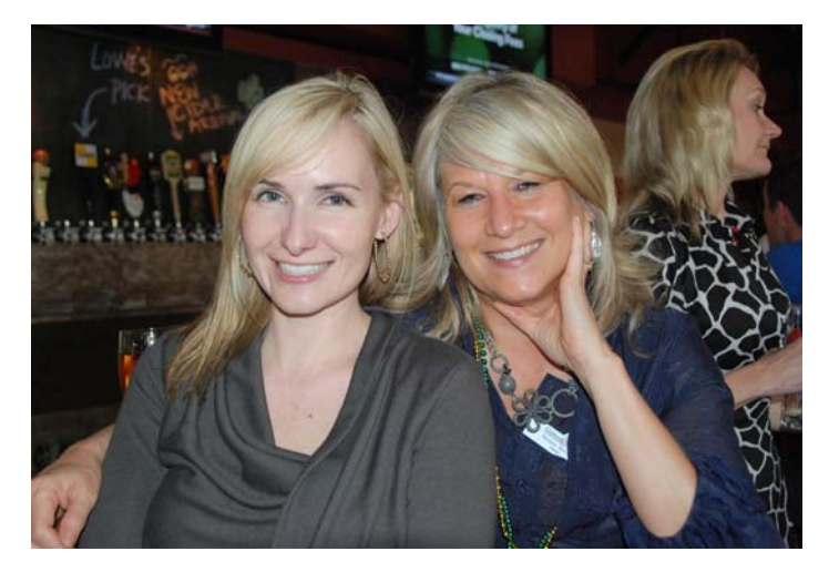
Global Brew Tap House & Lounge, March 22