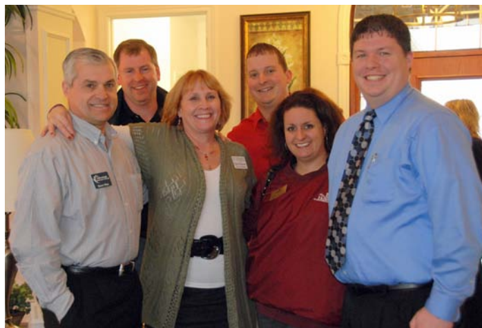
Prudential One Realty Centre, March 3