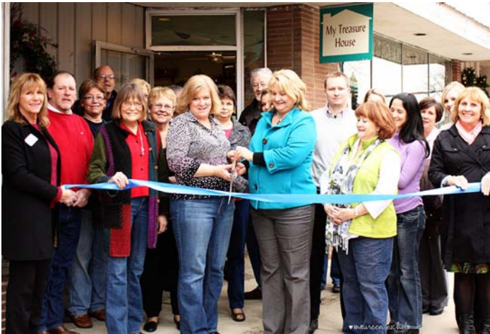
My Treasure House, March 15