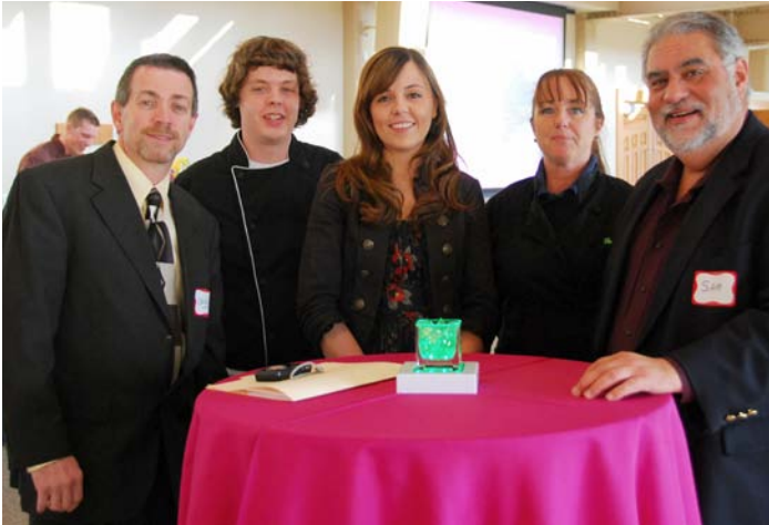
Bella Milano, March 31