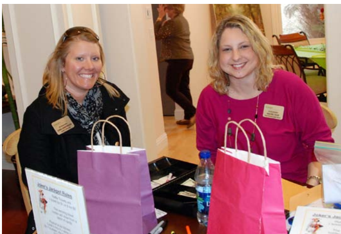
Prudential One Realty Centre, March 3