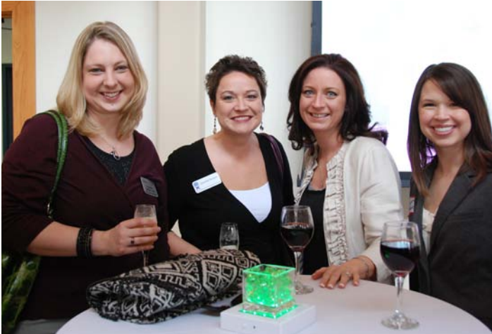
Bella Milano, March 31