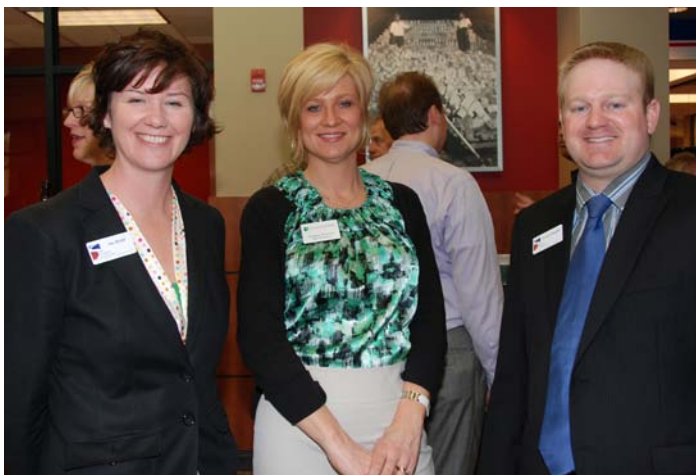
First Clover Leaf Bank, March 17