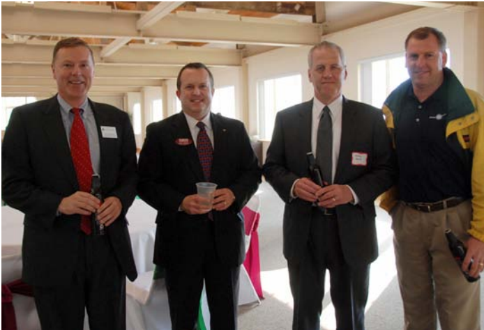
Bella Milano, March 31