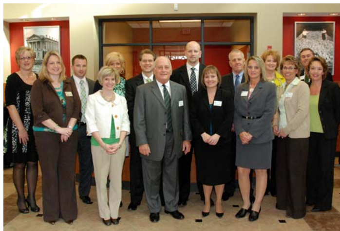
First Clover Leaf Bank, March 17