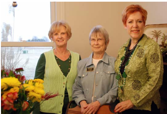
Prudential One Realty Centre, March 3