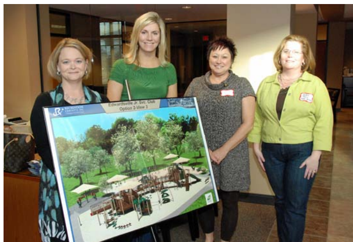
First Clover Leaf Bank, March 17