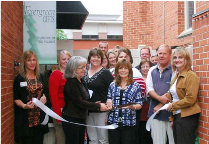
Always Evergreen Gifts at St. Boniface Catholic Church, November 8