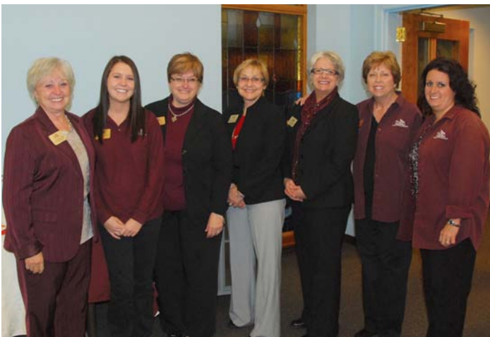
Hospice of Southern Illinois, November 17