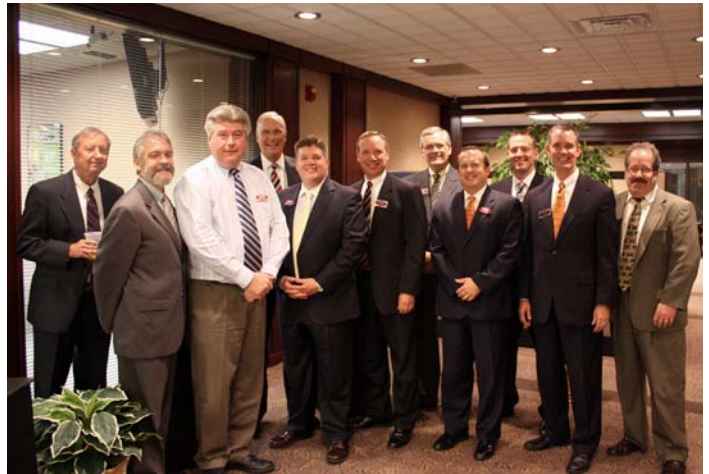
Greater Edwardsville Area Community Foundation at TheBANK of Edwardsville, November 3