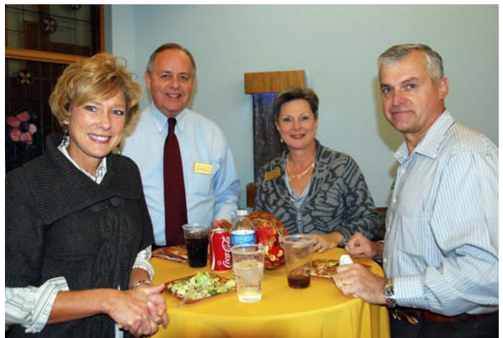
Hospice of Southern Illinois, November 17