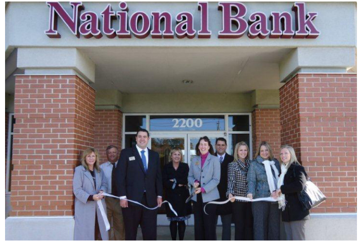
National Bank, November 10