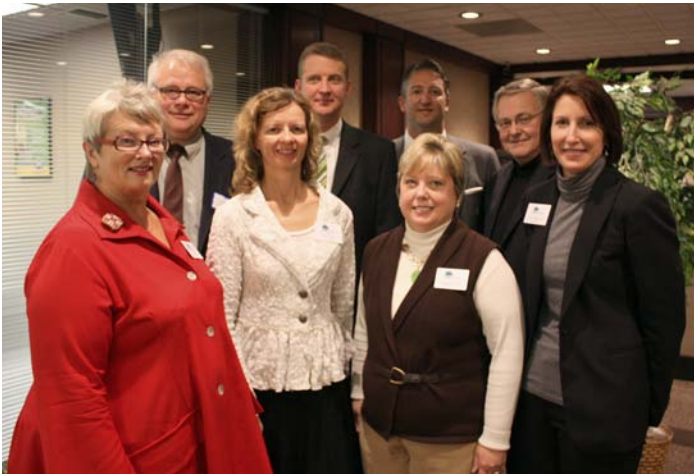
Greater Edwardsville Area Community Foundation at TheBANK of Edwardsville, November 3