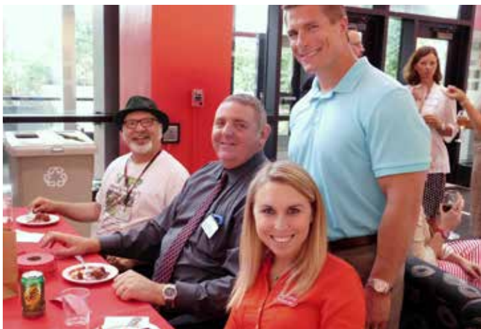
Hosted @ SIUE Graduate School, July 21