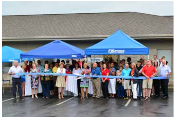
Ribbon Cutting @ Express Employment Professionals - 10 Year Anniversary, July 13