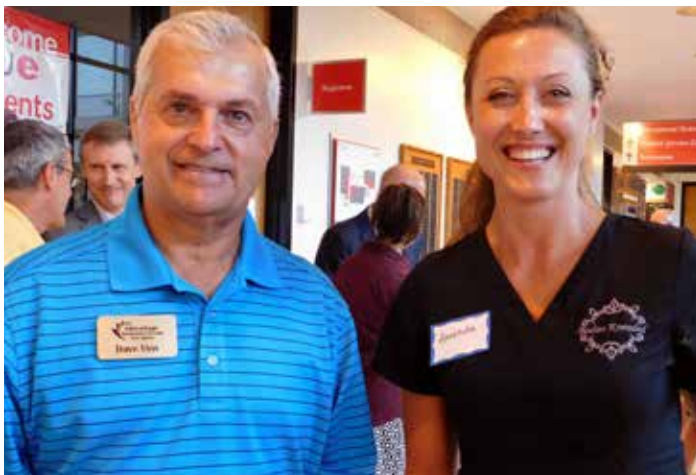
Hosted @ SIUE Graduate School, July 21