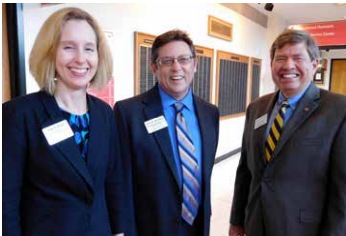
Hosted @ SIUE Graduate School, July 21