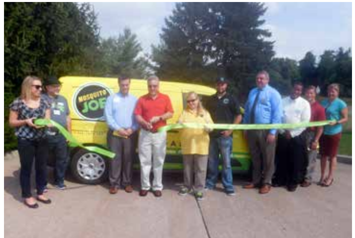
Ribbon Cutting @ Mosquito Joe of Madison County, July 25