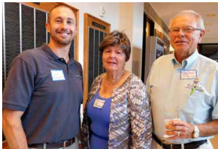
Hosted @ SIUE Graduate School, July 21