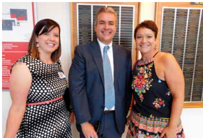
Hosted @ SIUE Graduate School, July 21