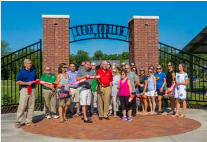
Ribbon Cutting @ Edwardsville's Leon Corlew Park, July 23