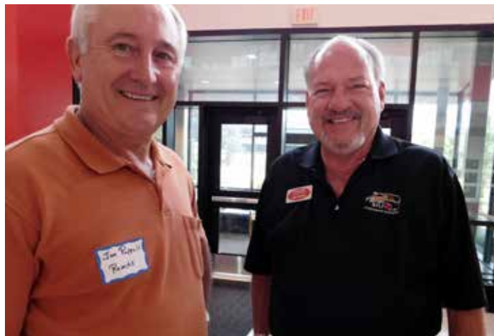
Hosted @ SIUE Graduate School, July 21