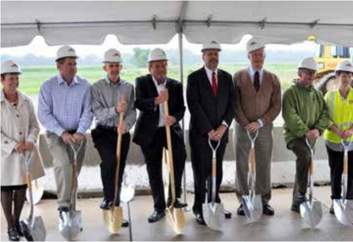
Gateway Commerce Center w/ Contegra Construction Company, LLC, July 8