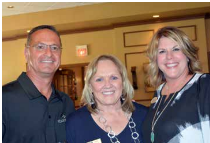
July 16 Business After Hours