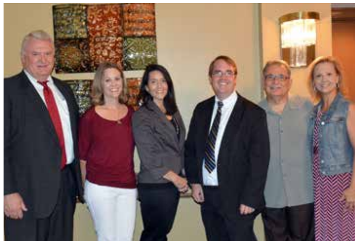
Sivia Business & Legal Services, West & Company, Granny 8 Mortgage & Sunset Hills Country Club, July 16