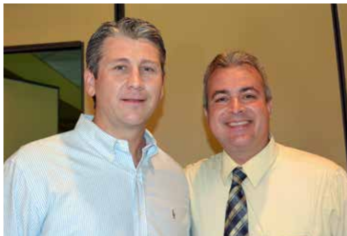
Sivia Business & Legal Services, West & Company, Granny 8 Mortgage & Sunset Hills Country Club, July 16