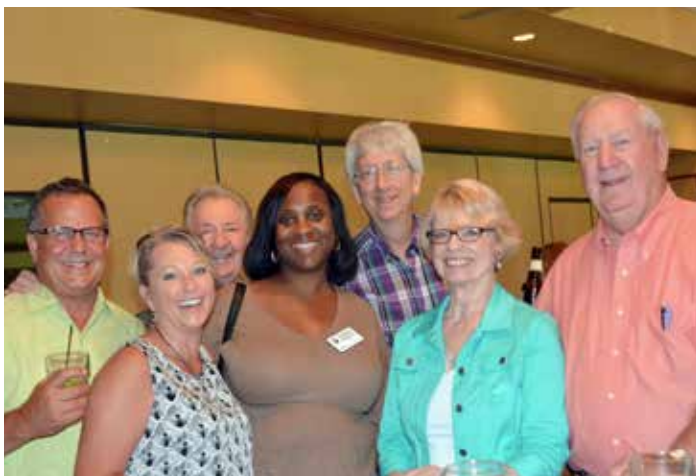
July 16 Business After Hours