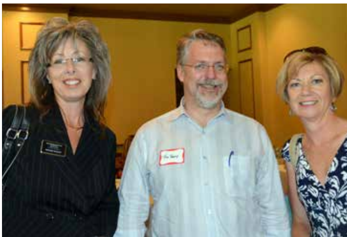
Sivia Business & Legal Services, West & Company, Granny 8 Mortgage & Sunset Hills Country Club, July 16