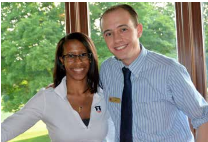
Sivia Business & Legal Services, West & Company, Granny 8 Mortgage & Sunset Hills Country Club, July 16