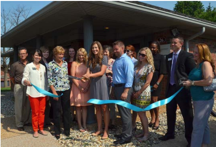
Bodies Kneaded, July 8