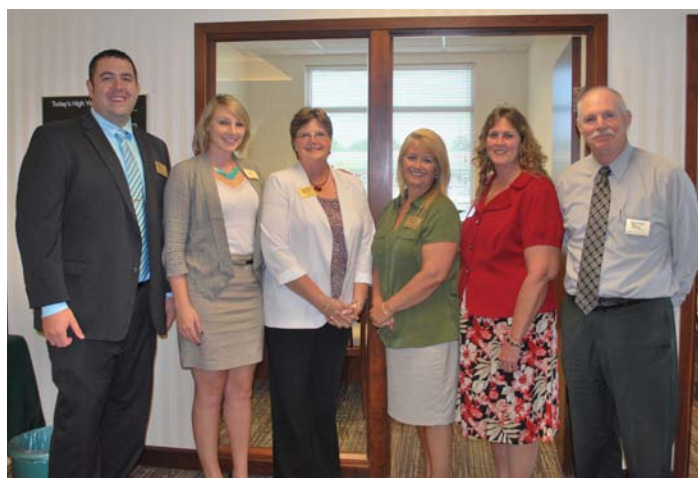
National Bank, July 25