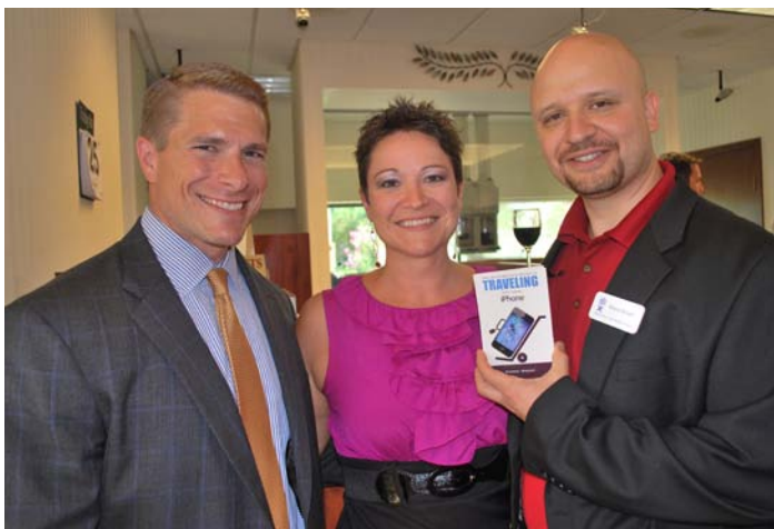
National Bank, July 25