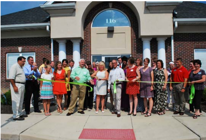
Associated Pediatric Dentistry, July 19