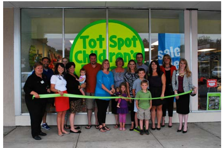
Tot Spot Children's Resale, July 30