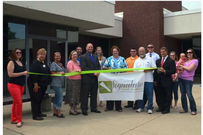
Signature Virtual Assistance, Inc., July 9