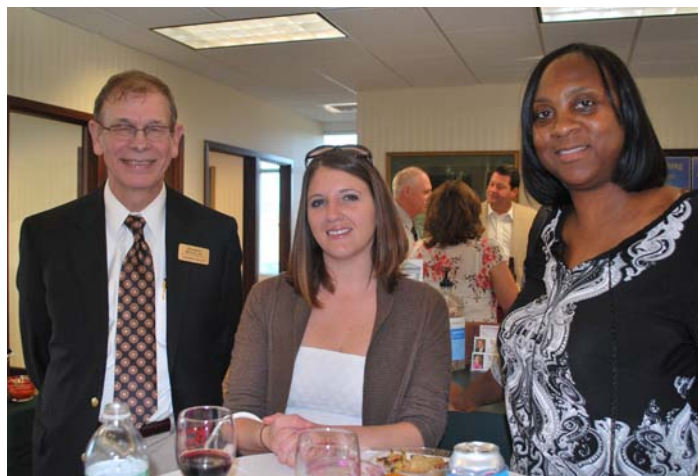
National Bank, July 25