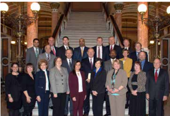
St. Louis Regional Chamber Illinois Lobby Day, March 11