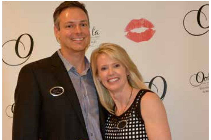
Ooh La La Spa, Anti-Aging & Wellness, March 19