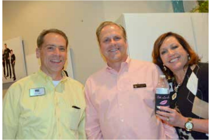
Ooh La La Spa, Anti-Aging & Wellness, March 19