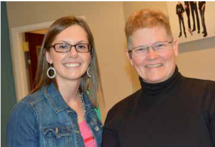
Ooh La La Spa, Anti-Aging & Wellness, March 19