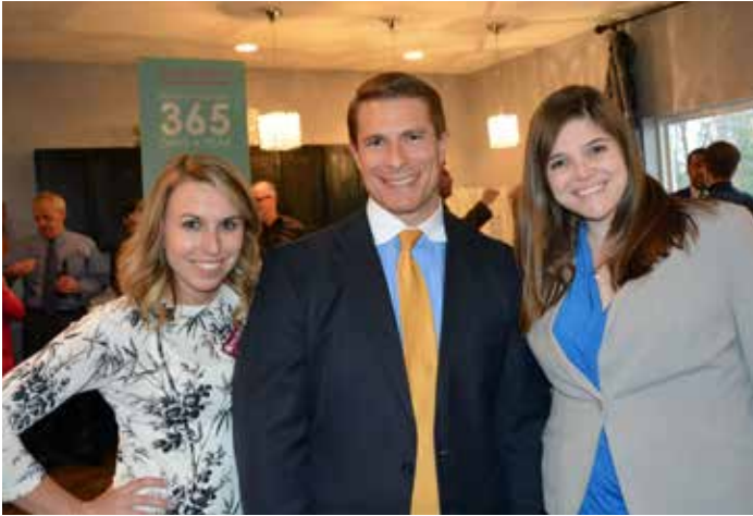
Ooh La La Spa, Anti-Aging & Wellness, March 19