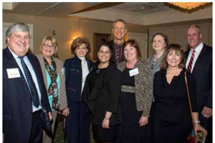
St. Louis Regional Chamber Illinois Lobby Day, March 11