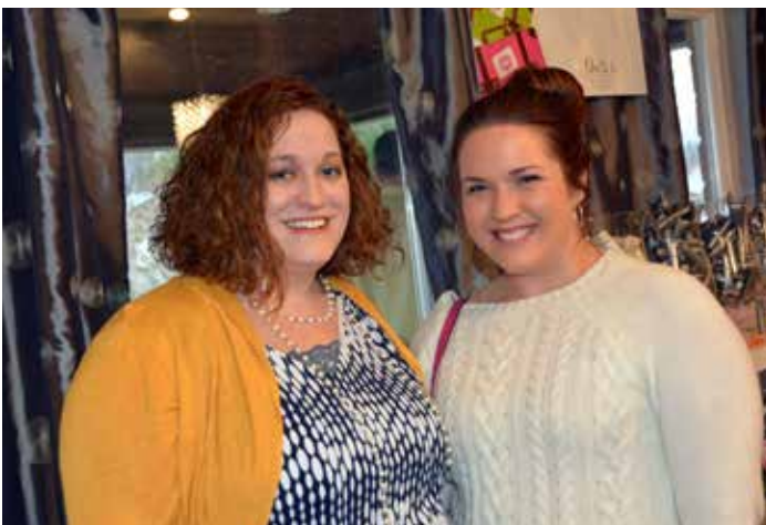
Ooh La La Spa, Anti-Aging & Wellness, March 19